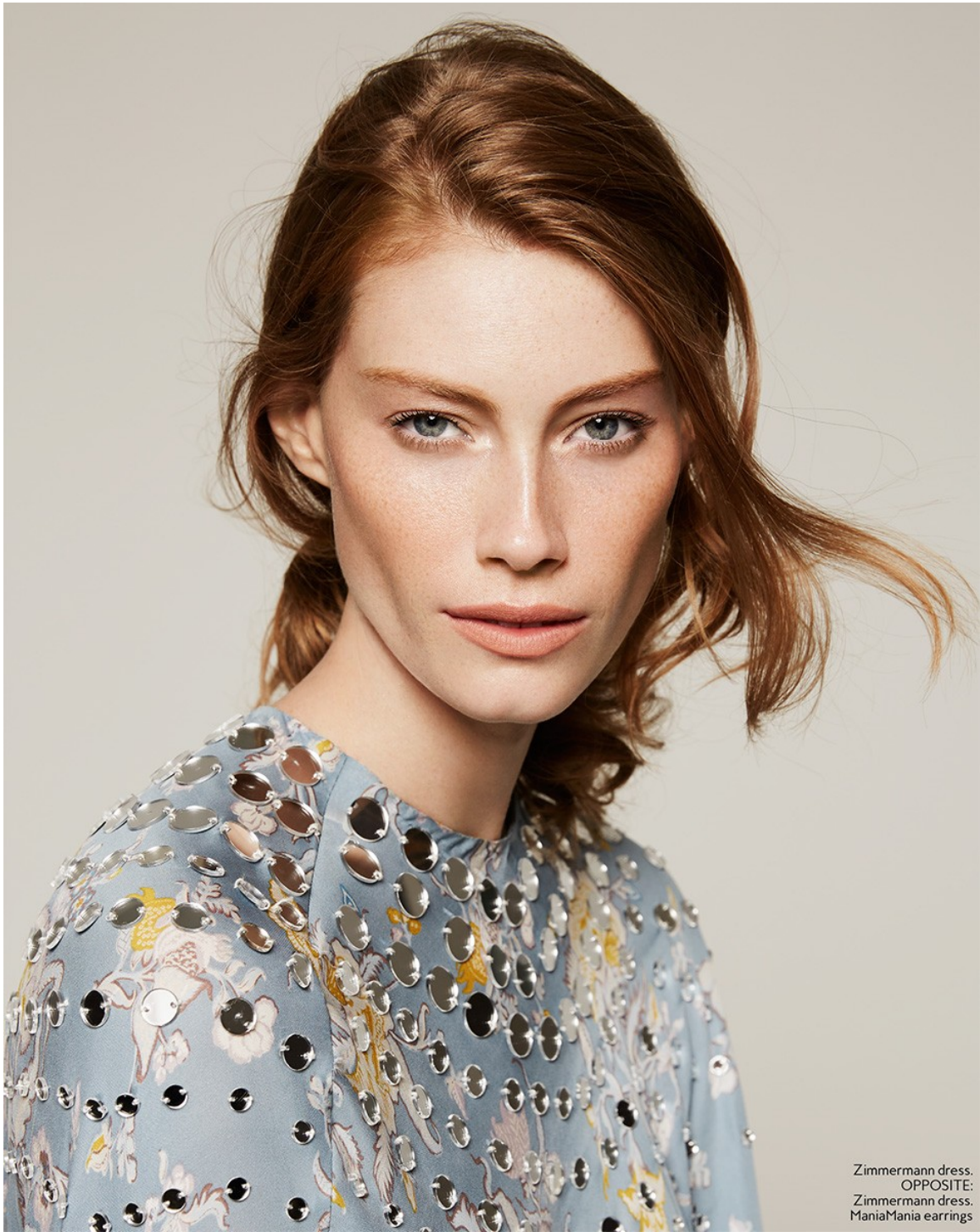
Zimmermann dress. OPPOSITE: Zimmermann dress. ManiaMania earrings