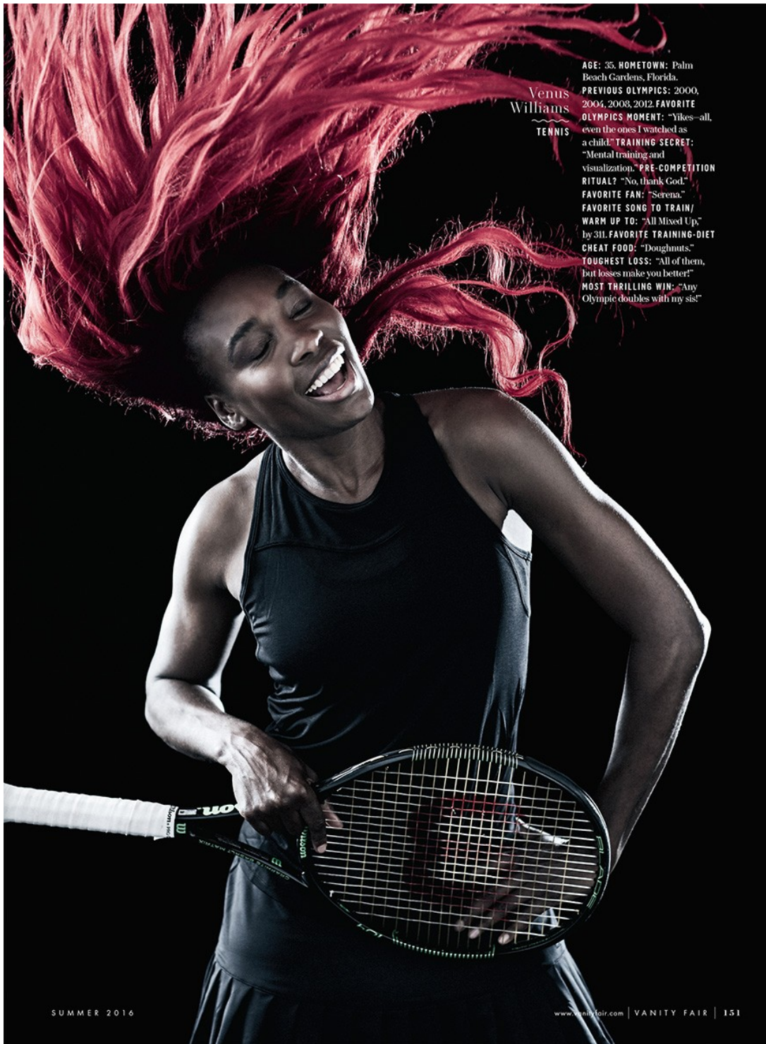
Venus Williams TENNIS

AGE: 33. HOMETOWN: Palm Beach Gardens, Florida. PREVIOUS OLYMPICS: 2000, 2004, 2008, 2012. FAVORITE OLYMPICS MOMENT: "Yikes—all, even the ones I watched as a child." TRAINING SECRET: "Mental training and visualization." PRE-COMPETITION RITUAL? "No, thank God." FAVORITE FAN: "Serena." FAVORITE SONG TO TRAIN/WARM UP TO: "All Mixed Up," by 311. FAVORITE TRAINING-DIET CHEAT FOOD: "Doughnuts." TOUGHEST LOSS: "All of them, but losses make you better!" MOST THRILLING WIN: "Any Olympic doubles with my sis!"