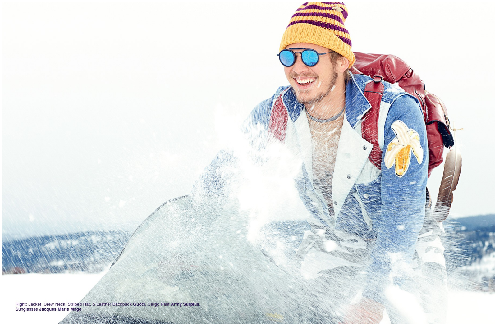
Right: Jacket, Crew Neck, Striped Hat, & Leather Backpack Gucci, Cargo Pant Army Surplus, Sunglasses Jacques Marie Mage