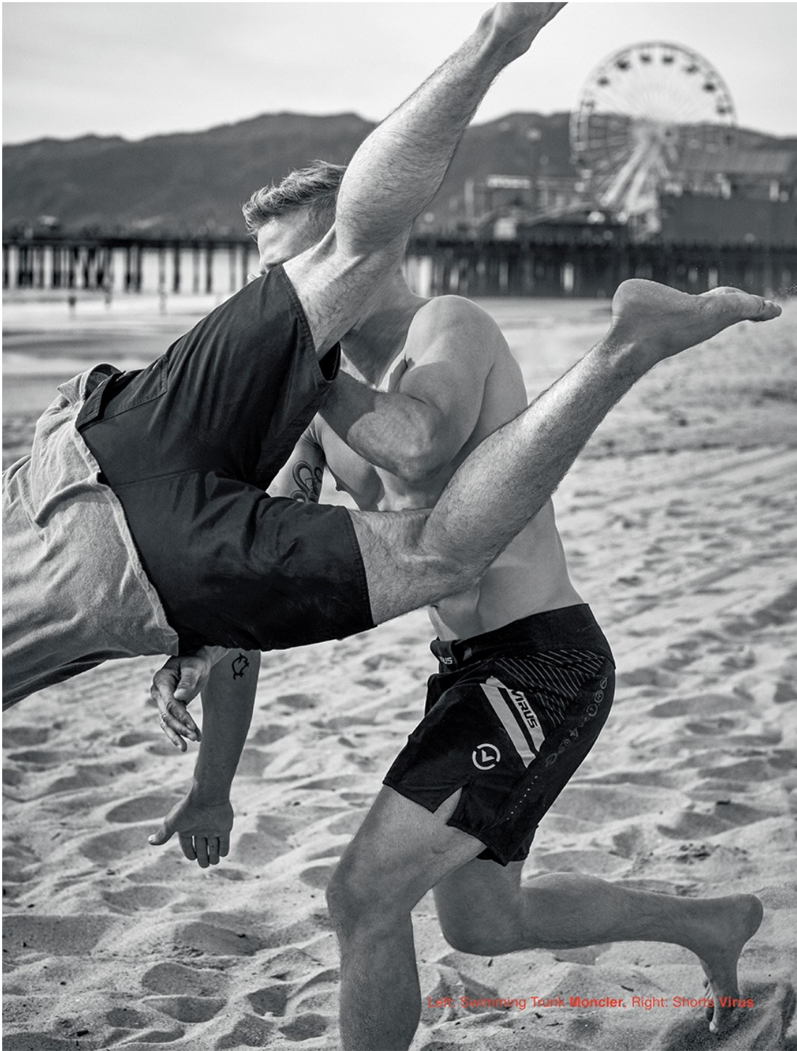
Left: Swimming Trunk Moncler. Right: Shorts Virus