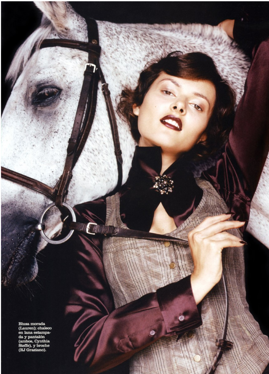
Blusa morada (Lauren); chaleco en lana estampa- da y pantalón (ambos, Cynthia Steffe), y broche (RJ Graziano).