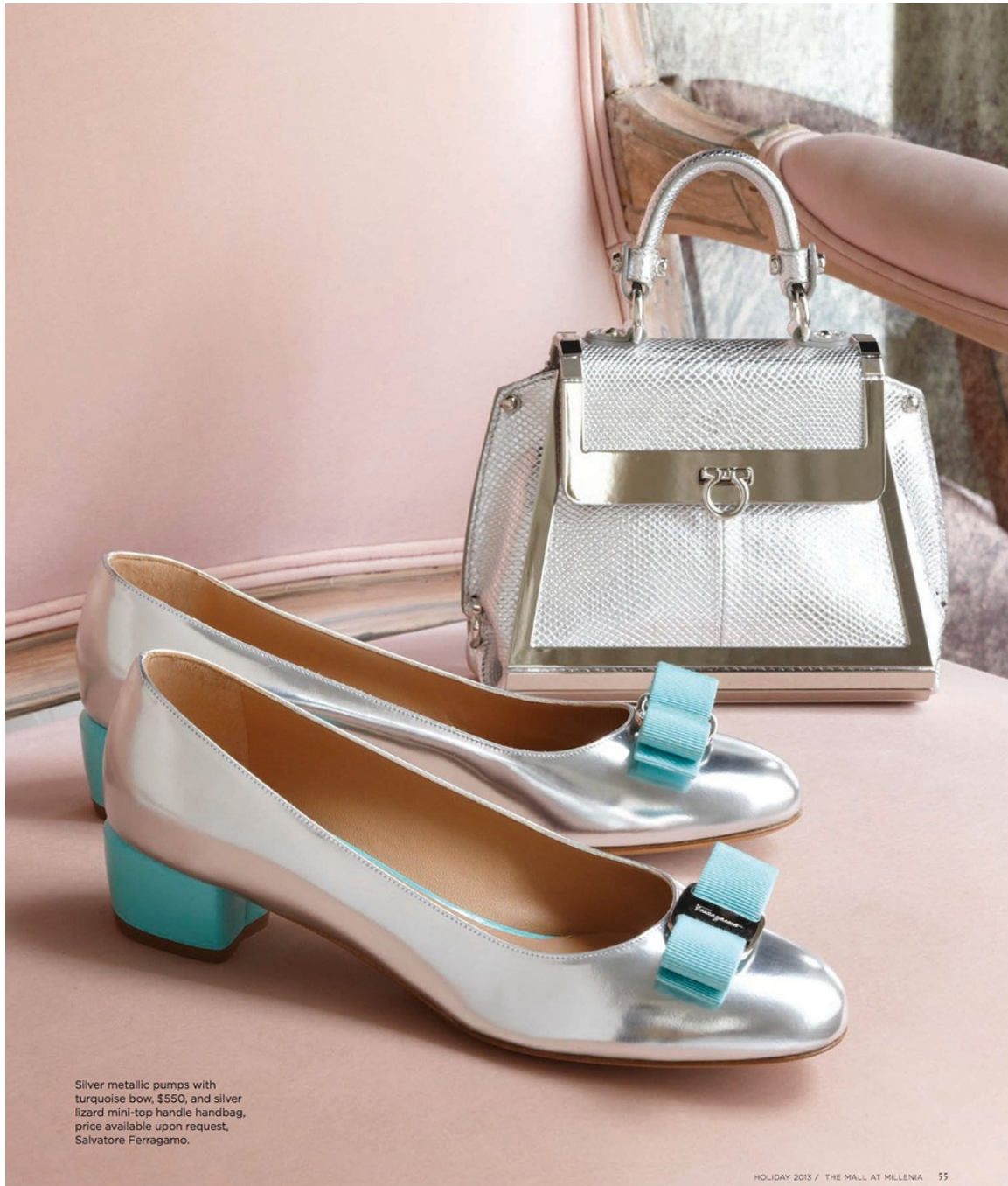
Silver metallic pumps with turquoise bow, $550, and silver lizard mini-top handle handbag, price available upon request, Salvatore Ferragamo.