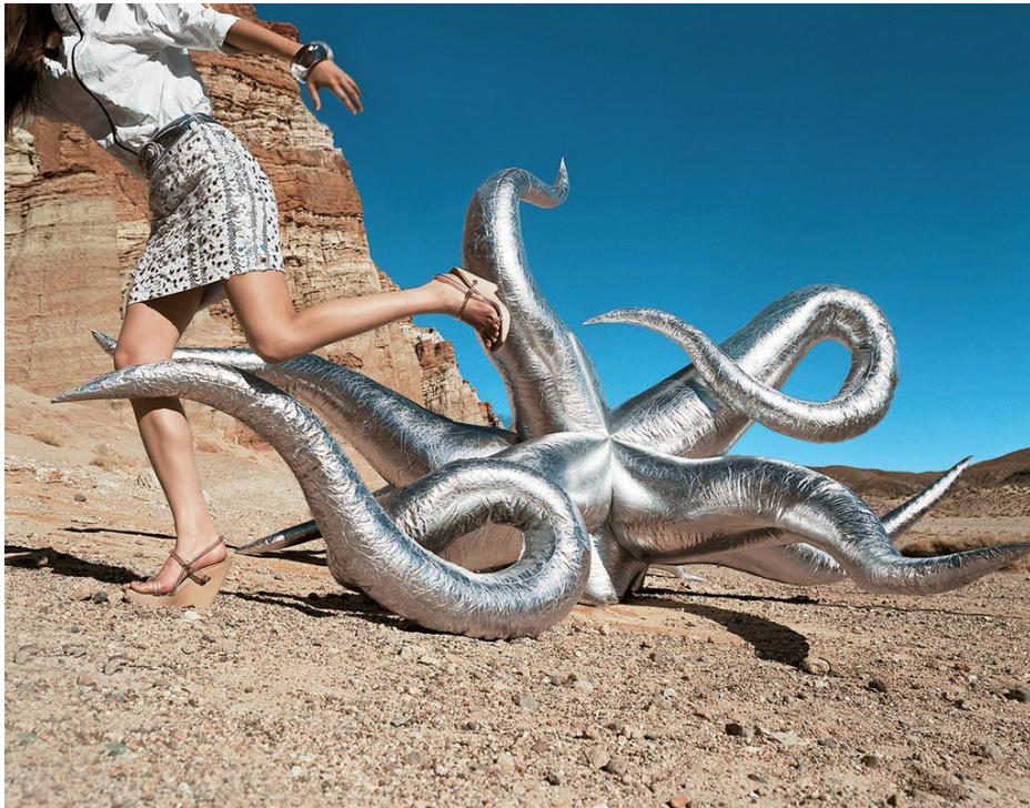
Blossom American Appareil: minigonna di pique brodée e cintura di pelle argenteo, D&G. Bracciale Dinosaur Design: sandali platform di legno e PVC, Calvin Klein Collection.