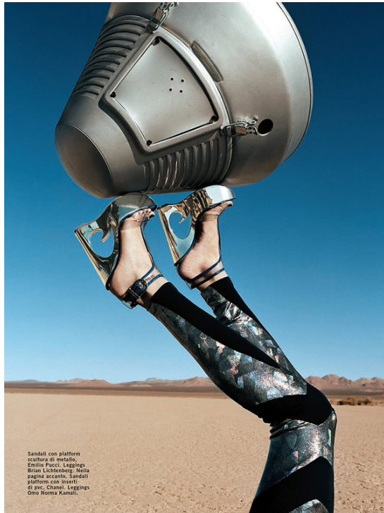
Sandali con platform scultura di metallo. Emilio Pucci. Leggings Brian Lichtenberg. Tetta pagina accanto. Sandali platform con inserti di pvc. Chanel. Leggings Ono Norma Kamali.