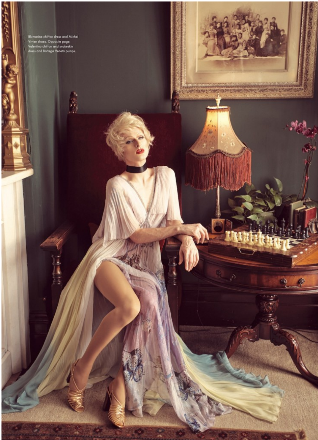
Blumarine chiffon dress and Michel Vivien shoes. Opposite page: Valentino chiffon and snakeskin dress and Bottega Veneta pumps.