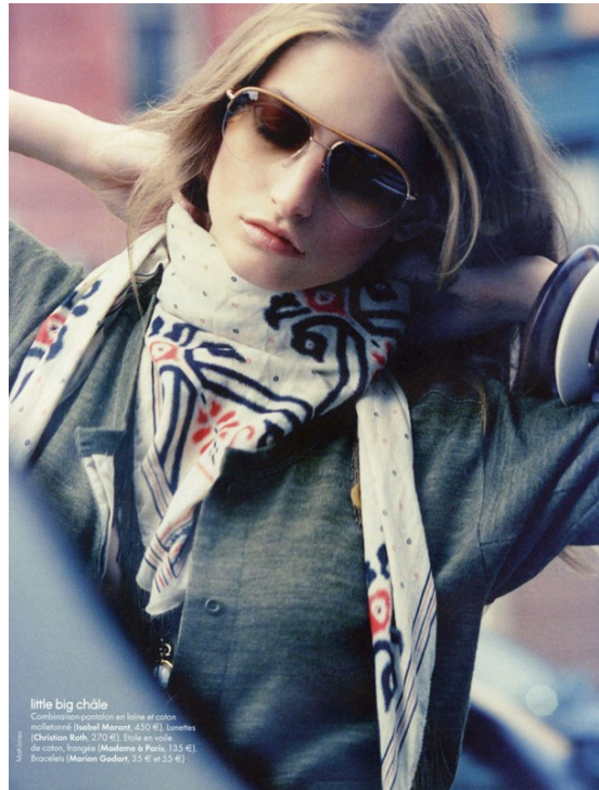
little big chôle Combinaison position en laine et coton multicolore (Hugoboss) 2 800 € | Lunettes (Christian Roth) 270 € | Etola en soie de coton, frangia (Madame & Pire) 135 € | Brooches (Marion Godart) 3,5 € et 5,5 €