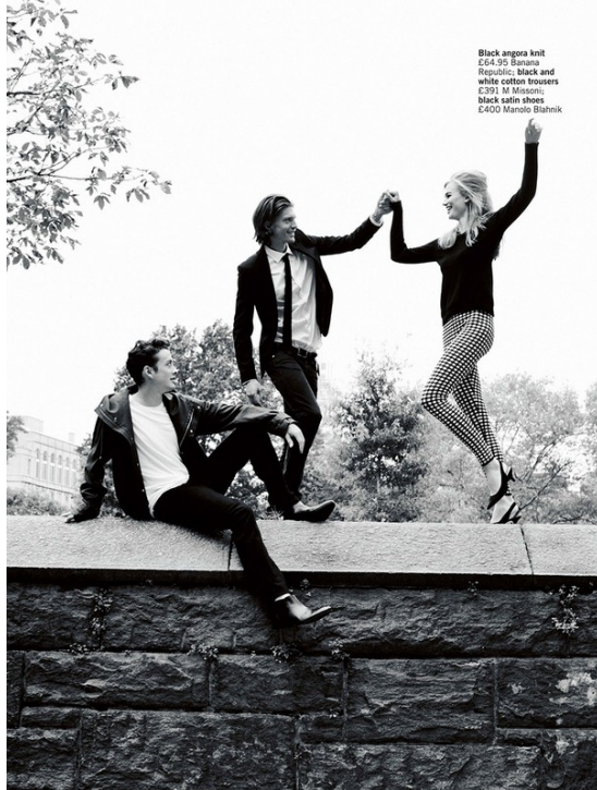
Black angora knit E24 39 Sonoma Republic; black and white cotton trousers E391 M Missions; black satin shoes E240 Mando Barink