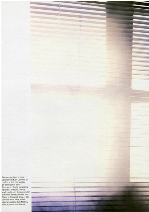
Piccolo cardigan a pois, Valentino W.E.D. Canotta di cinturini a fiori con scollo all'americana, John Richmond, Tenda veneziana colorata, Mottura, Ficus sugli occhi con il mix eyeliner di Colour Perfection nei toni Black e Charcoal Grey e, per completare il look, sulle labbra L'Inchiesta Silk Meadow Pink, tutto di Max Factor.