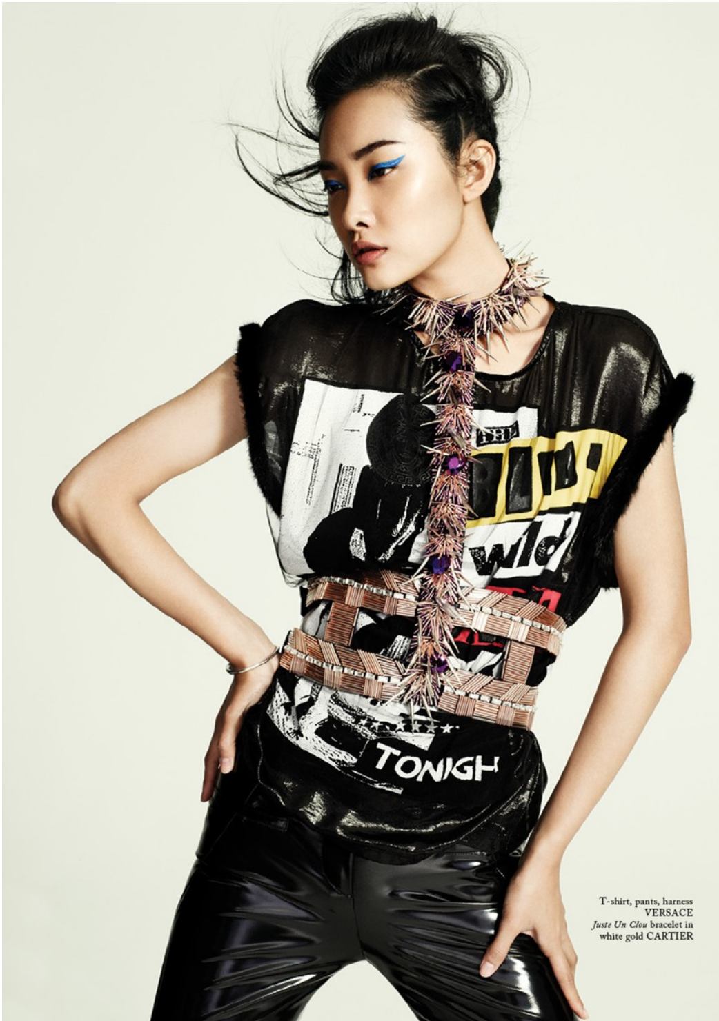
T-shirt, pants, harness VERSACE Juste Un Clou bracelet in white gold CARTIER