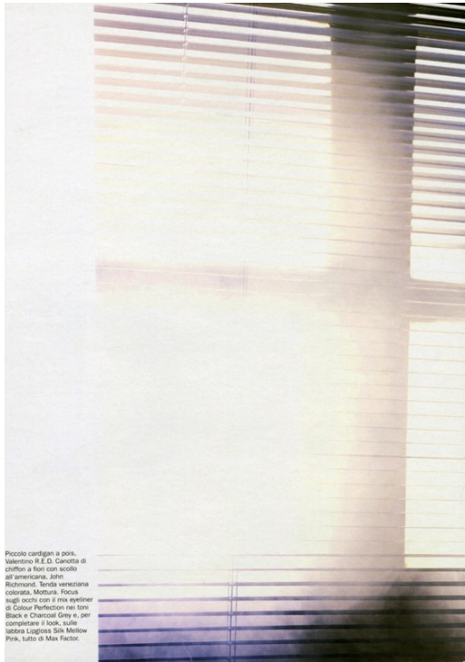
Piccolo cardigan a pois, Valentino W.E.D. Canotta di chiffon a fiori con scollo all'americana, John Richmond, Tenda veneziana colorata, Mottura, Fucus sugli occhi con il mix eyeliner di Colour Perfektion nei toni Black e Charcoal Grey e, per completare il look, sulle labbra L'Inchiesta Silk Meadow Pink, tutto di Max Factor.