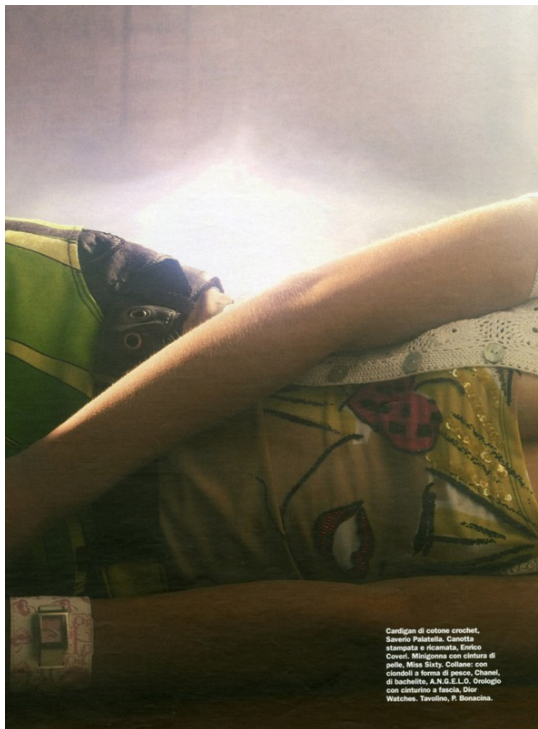
Cardigan di cotone crochet, Savano Petalita, Canotta stampata e ricamata, Emilio Coveri, Minigonna con cintura di pois, Nela Dirty, Collare con orecchini a forma di pesce, Chanel, di sbalzo, A.N.D.S.E.L.S., Oregano con cinturino a fascia, Dior Watches, Tivolino, P. Bonacchi.