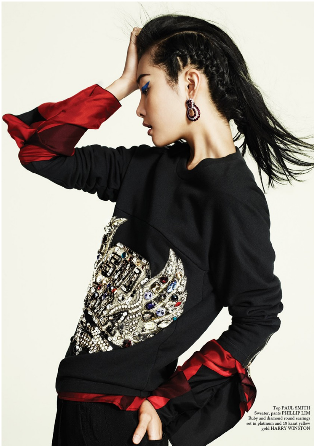
Top PAUL SMITH Sweater, pants PHILLIP LIM Ruby and diamond round earrings set in platinum and 18 karat yellow gold HARRY WINSTON