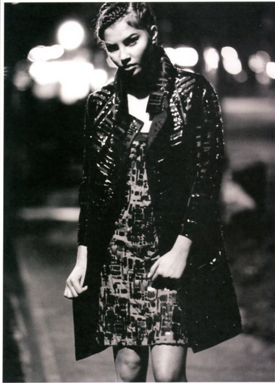
Patent-leather silk-embroidered coat and nylon-and-silk plastic-embroidered dress by NARCISO RODRIGUEZ .