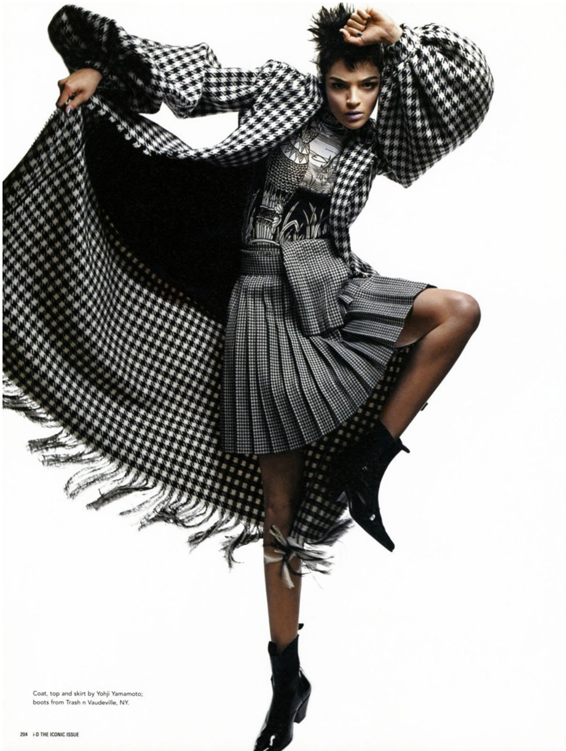
Coat, top and skirt by Yohji Yamamoto; boots from Trash n Vaudeville, NY.