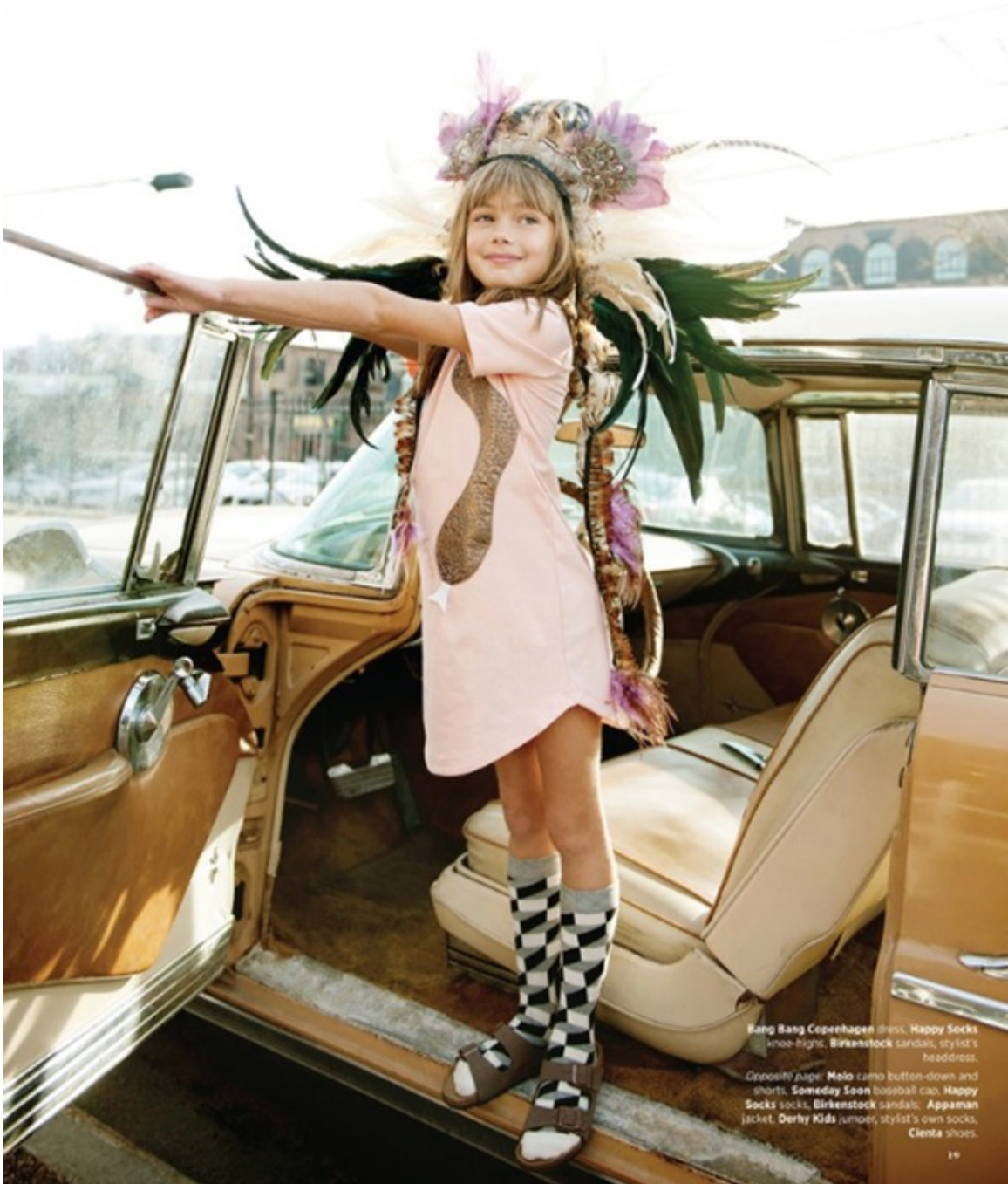
King Bang Copenhagen dress, Happy Socks knee-highs, Birkenstock sandals, stylist's headdress. Opposite page: Malo camo button-down and shorts, Someday Soon baseball cap, Happy Socks socks, Birkenstock sandals, Appaman jacket, Derby Kids jumper, stylist's own socks, Ciente shoes.