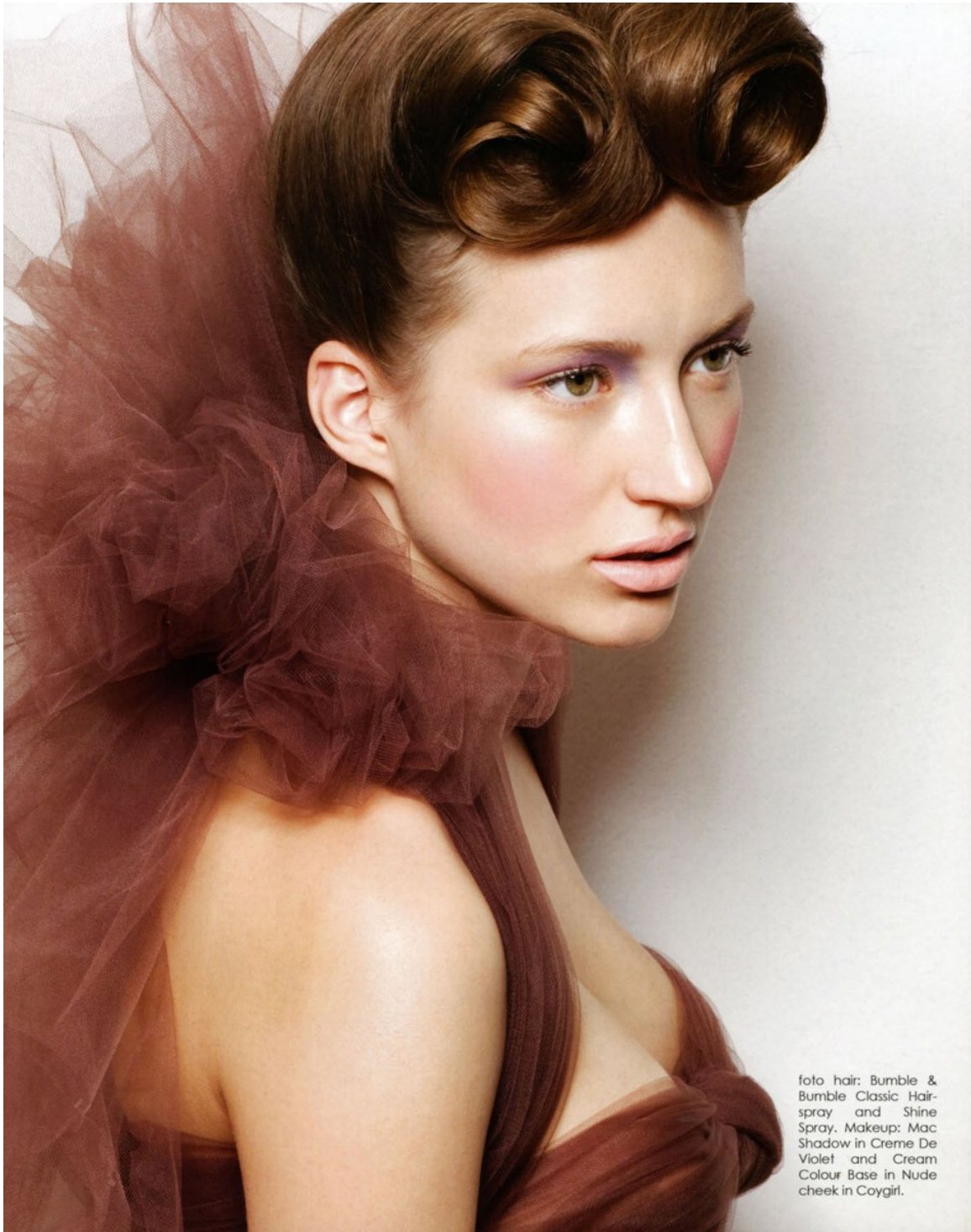
foto hair: Bumble & Bumble Classic Hair-spray and Shine Spray. Makeup: Mac Shadow in Creme De Violet and Cream Colour Base in Nude cheek in Coygirl.