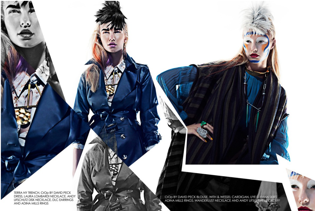
TERRA NY TRENCH, CLOP BY DAVID PECK DRESS, LAURA LOMBARDI NECKLACE, ANDY LIFSCHUTZ DISK NECKLACE, DLC EARRINGS AND ADINA MILLS RINGS