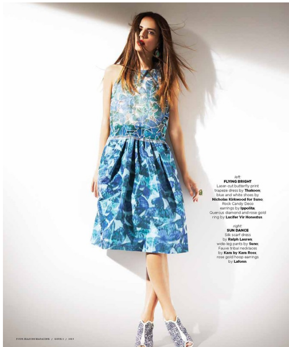
left FLYING BRIGHT Laser cut butterfly print trapeze dress by Thakoon , blue and white dress by Nicholas Kirkwood for Suno , Rocci Candy Deco earrings by Ippolita , Quercus diamond and rose gold ring by Leifur Vi Hovestera right SUN DANCE Silk scarf dress by Ralph Lauren , wide-leg pants by Seno , Favre tribal necklaces by Kara by Kara Ross , rose gold hoop earrings by Laforet