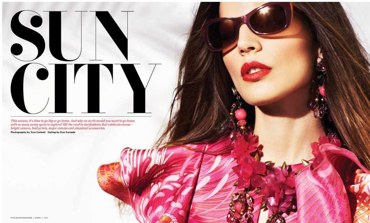
CLOP BY DAVID PECK BLOUSE, WITH & WESSEL CARDIGAN, UYE SUBANA SKIRT, ADINA MILLS RINGS, WANDERLUST NECKLACE AND ANDY LIFSCHUTZ NECKCUFF

This season, it's time to go big or go home. And why on earth would you want to go home, with so many sunny spots to explore? Hit the road in hot fashions that celebrate excess—bright colours, bold prints, major volume and abundant accessories.