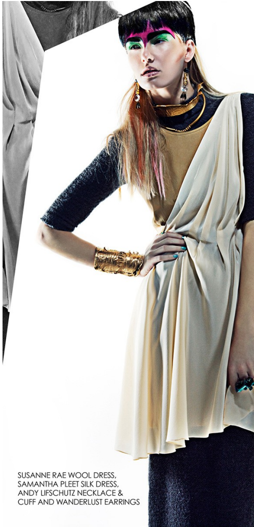
SUSANNE RAE WOOL DRESS, SAMANTHA PLEET SILK DRESS, ANDY LIFSCHUTZ NECKLACE & CUFF AND WANDERLUST EARRINGS