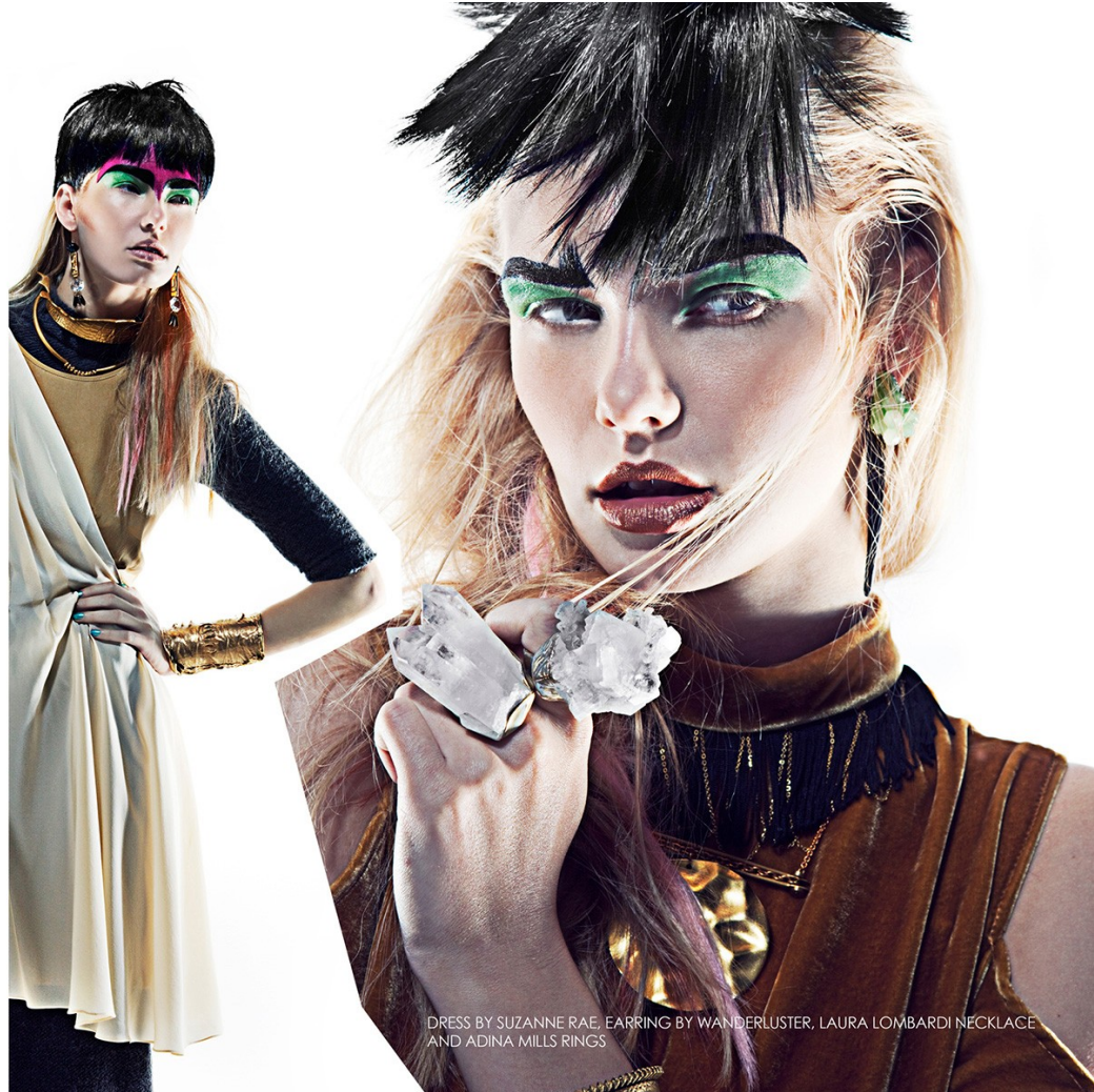
DRESS BY SUZANNE RAE, EARRING BY WANDERLUST, LAURA LOMBARDI NECKLACE AND ADINA MILLS RINGS