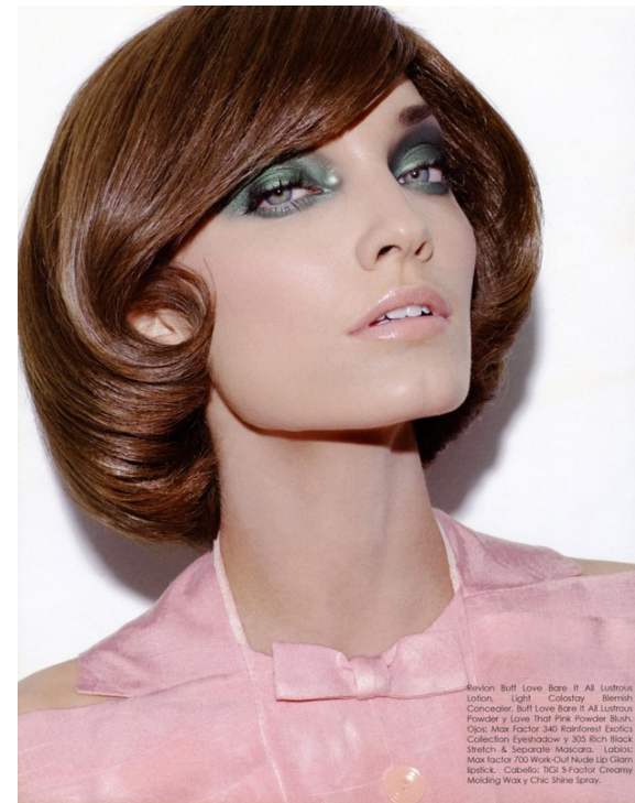
Revlon Buff Love Bare It All Lustrous Lotion, Light Catalyst Blemish Concealer, Buff Love Bare It All Lustrous Powder y Love That Pink Powder Blush. Olay: Max Factor 340 Barrowel Exotic Collection Eyeshadow y 305 Rich Black Stretch & Separate Mascara. L'Oréal: Max Factor 700 Work-Out Nude Lip Cream lipstick. Catwalk: TGI 3 Factor Creamy Holding Wax y Chic Shine Spray.