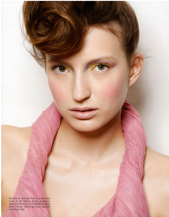
Bumble & Bumble Hair Powder and Does It All Styling Spray. Makeup: Mac Eye Shadow in Scintille Emeralds and Canary Yellow lips. Mac, L'Oréal in Pottery Pink.