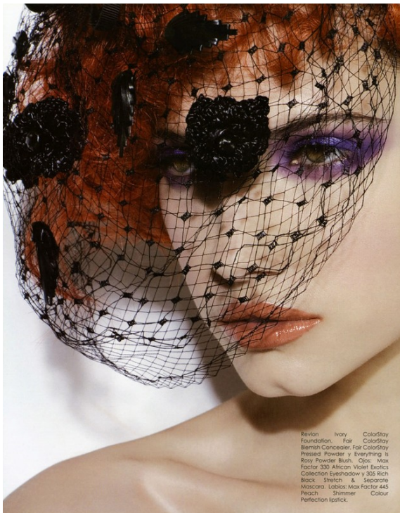
Revlon Ivory Catalyst Foundation, Fair Catalyst Blemish Concealer, Fair Catalyst Pressed Powder y Evening is Rosy Powder Blush. Olay: Max Factor 333 African Violet Beatrix Collection Eyeshadow y 305 Rich Black Stretch & Separate Mascara. L'Oréal: Max Factor 445 Peach Shimmer Colour Perfection lipstick.