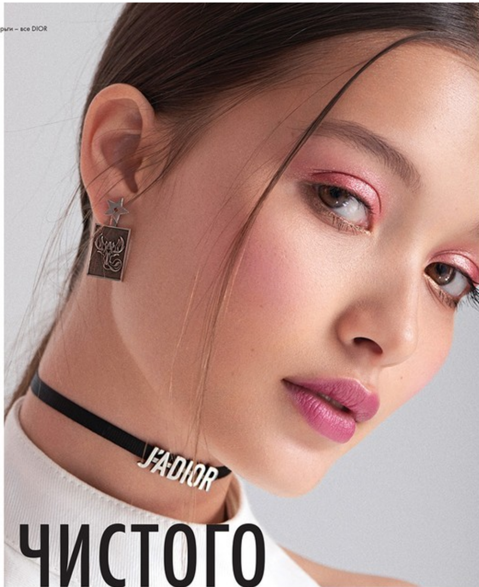
СТИЛЬ: Iya AKASHEVA