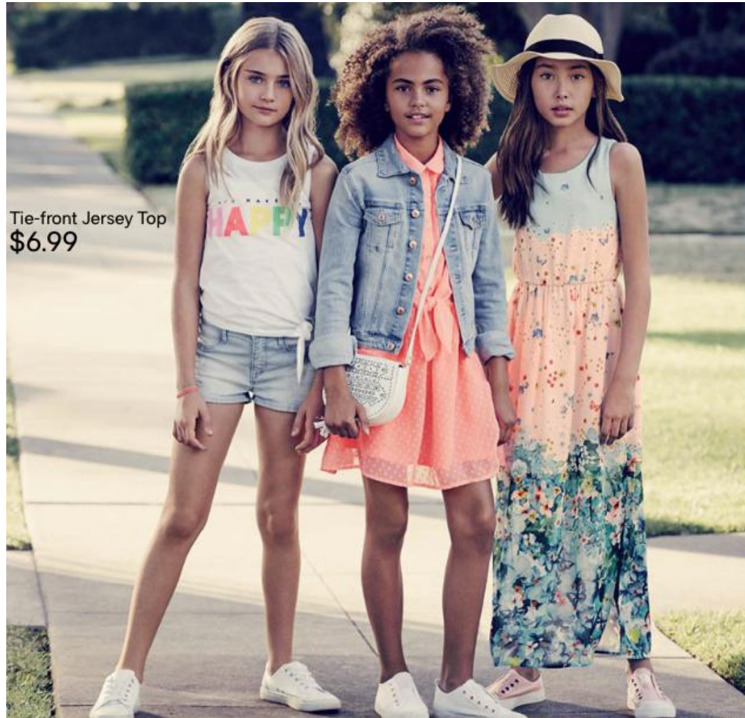
Tie-front Jersey Top $6.99