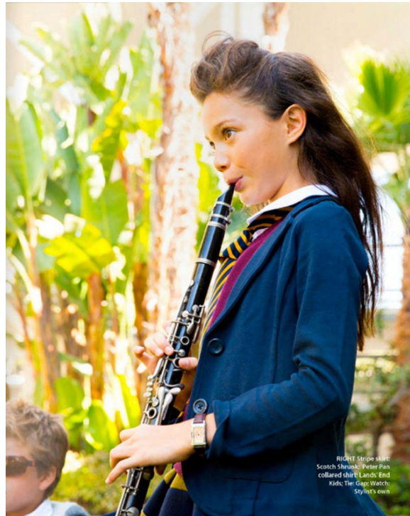
RIGHT: Stripe skirt; Scotch Shrum; Peter Pan collared shirt; Lando; End Kids; The Gap; Watch; Stylist's own