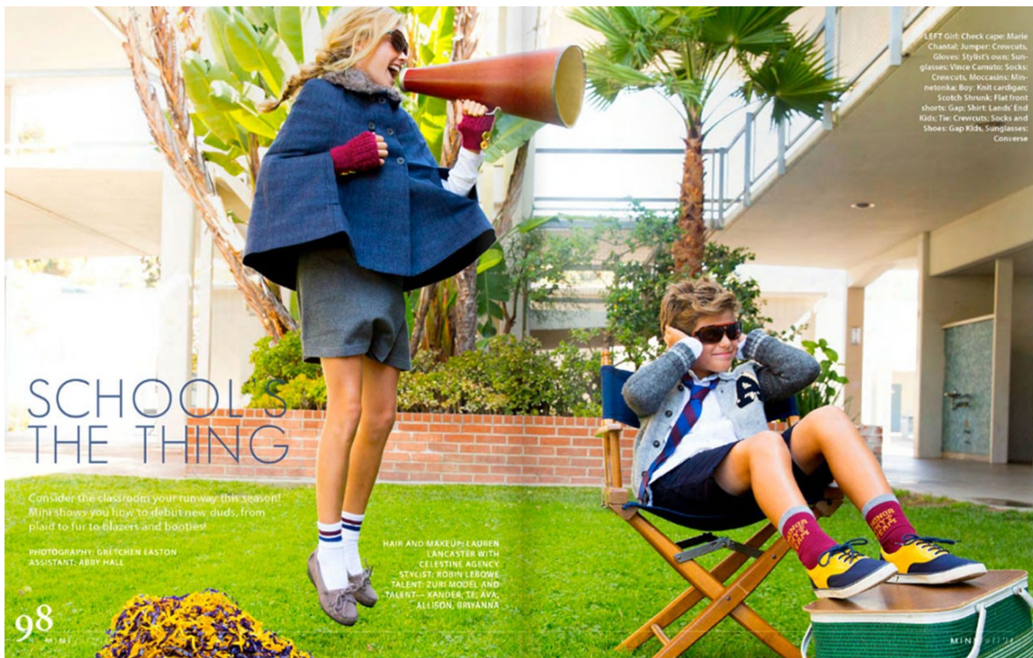
LEFT: Girl: Check cape; Marie Chantal; Jumper; Crewcuts; Gloves; Stylist's own; Sunglasses; Vince Camera; Socks; Crewcuts; Moccasins; Minnetonka; Boy: Knit cardigan; Scotch Shrumk; Flat front shorts; Gap; Shirt; Lando; End Kids; The Crewcuts; Socks and Shoes; Gap Kids; Sunglasses; Converse