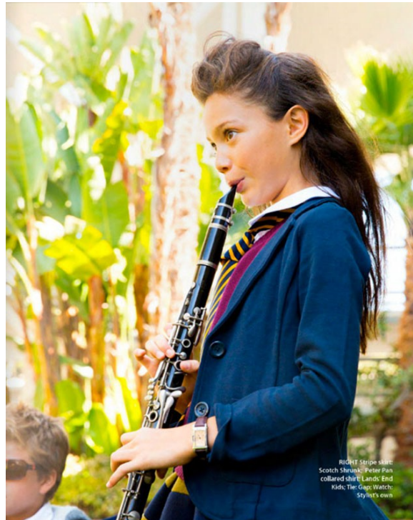
RIGHT: Stripe skirt; Scotch Shrumk; Peter Pan collared shirt; Lando; End Kids; The Coop; Watch; Stylist's own