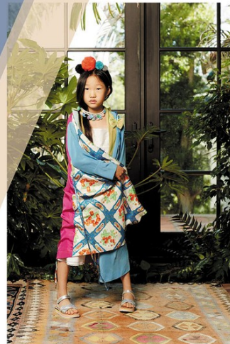
Tarabini Tagia Kimono Tuchinda Svea Jumpsuit Maison Mangostan Coco Plum Silver Sandals Amour Bows Rocks Headband