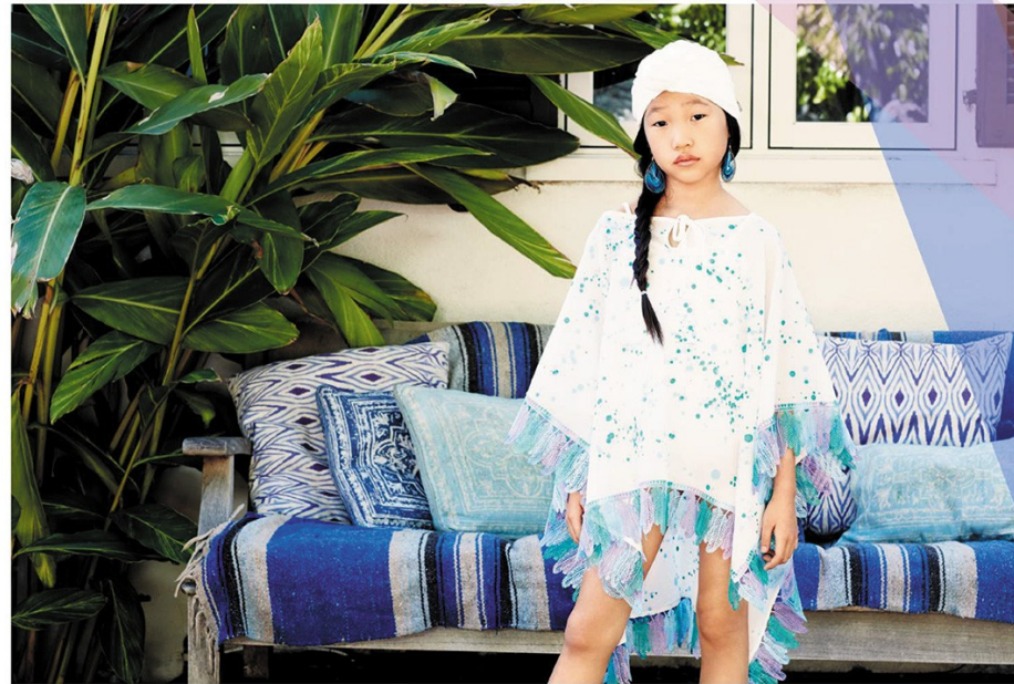
Tago Splash Poncho Mandy Tangerine Mini Cashmere Top Knot Turban