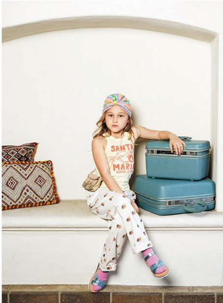
The Animals Observatory Santa Maria T-Shirt and Raw White Fruit Pants from Shan & Toad We Love Colors Solid Color Nylon Socks Ultra Violet Kids Fruit Stripe Turban