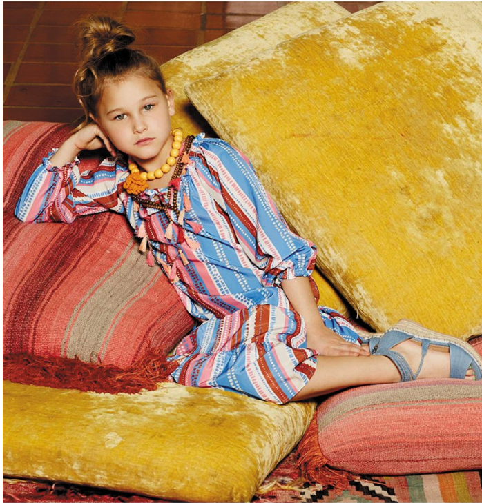
Ultra Violet Kids Taffy Peasant Dress Bianca Makris Kids Yellow Big Bead Necklace Steve Madden Kids WrkWrk Sandal