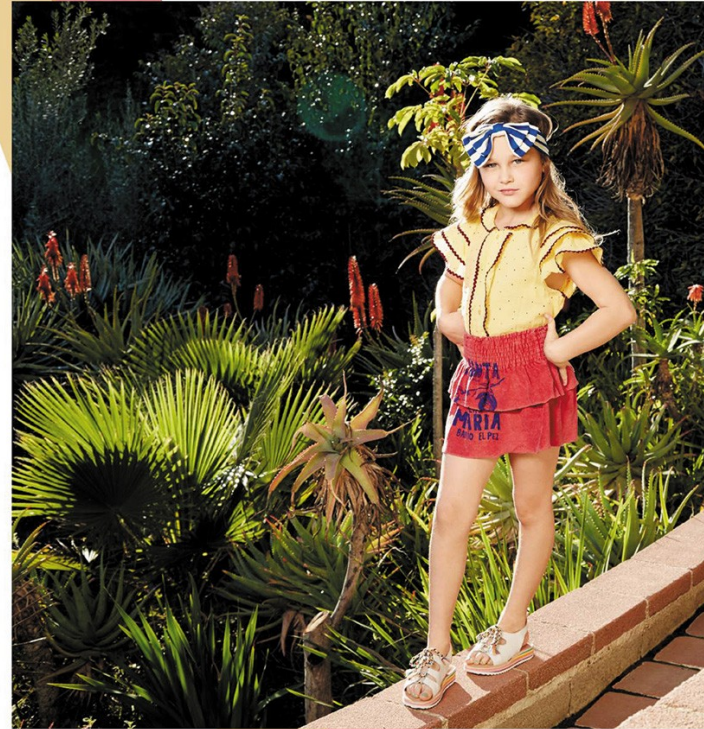
The Animals Observatory Parakeet Dot Shirt & Kiwi Santa Maria Skirt from Shan & Toad Milk N Soda Stripe Stretch Headband Maison Mangostan Guajava Sandals