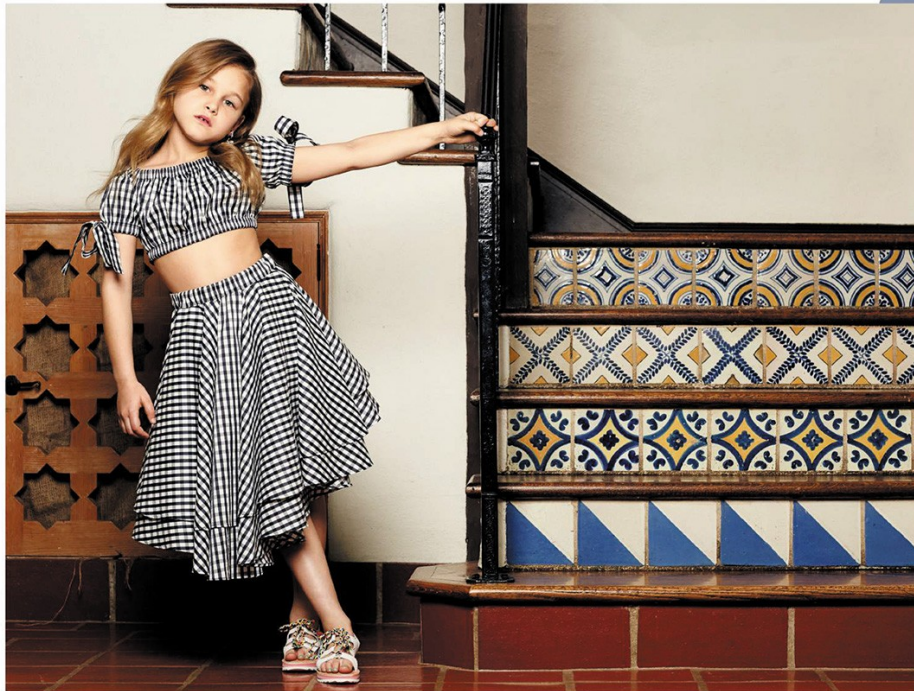
Airfish Lola Top and Oslo Skirt Maison Mangostan Guajava Sandals