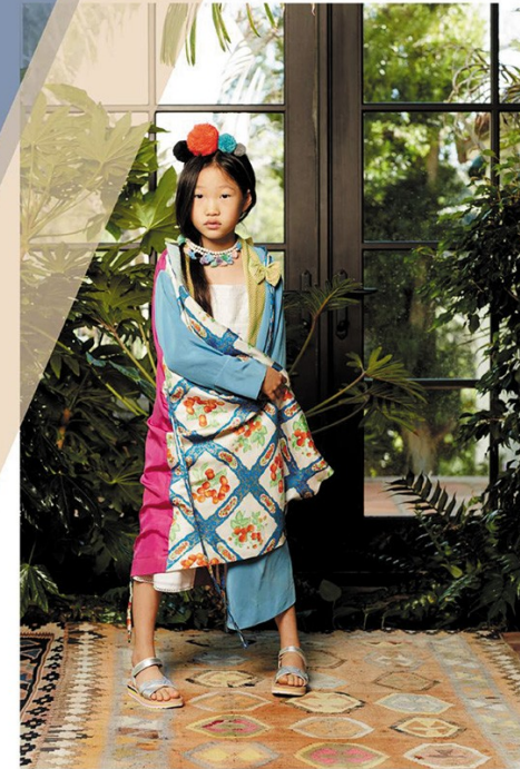
Tarabini Tagia Kimono Tuchinda Svea Jumpsuit Maison Mangostan Coco Plum Silver Sandals Amour Bows Rocks Headband