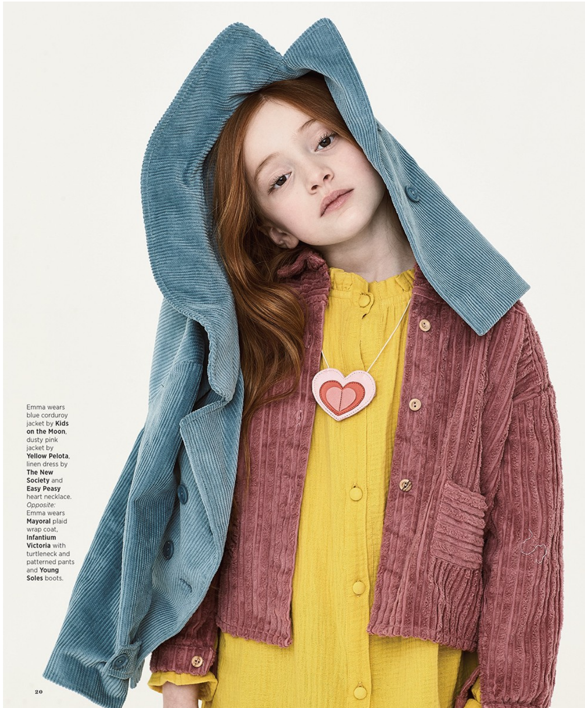
Emma wears blue corduroy jacket by Kids on the Moon , dusty pink jacket by Yellow Pelota , linen dress by The New Society and Easy Peasy heart necklace. Opposite: Emma wears Mayoral plaid wrap coat, Infantium Victoria with turtleneck and patterned pants and Young Soles boots.