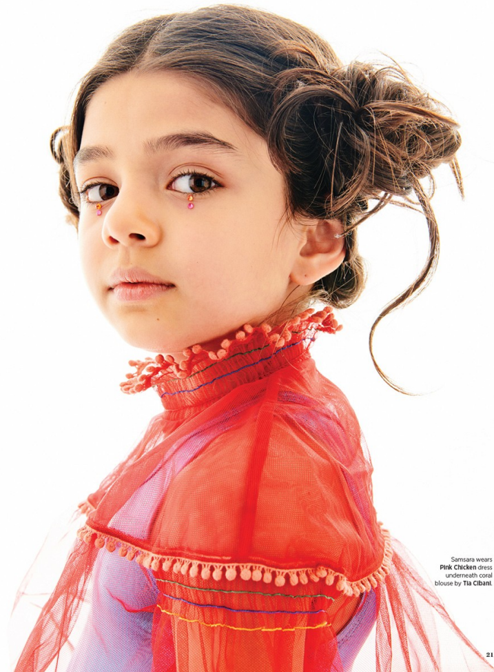
Samsara wears Pink Chicken dress underneath coral blouse by Tia Cibani.