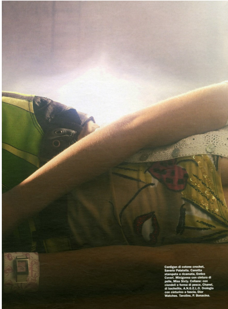
Cardigan di cotone crochet, Saverio Palatella. Canotta stampata e ricamata, Enrico Caveri. Minigonna con cintura di pelle, Miss Sixty. Collane: con ciondoli a forma di pesce, Chanel, di bachelite, A.N.G.E.L.O. Orologio con cinturino a fascia, Dior Watches. Tavolino, P. Bonacina.