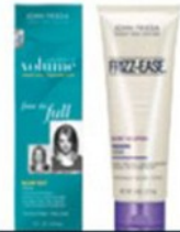
DAVID'S FAVOURITE PRODUCTS

"It's fantastic to see the John Frieda® range celebrate 25 years! My all-time favourite product is Frizz-Ease® Original Serum. When I use it, I'm confident styles I create will have longevity without frizz!"