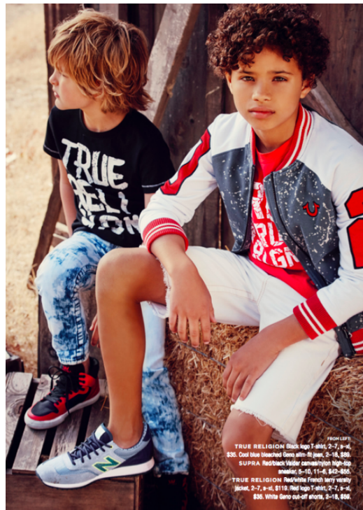
FROM LEFT: TRUE RELIGION Black logo T-shirt, 2-7, 8-14, $36. Cool Max Untracked Crew with 86 jeans, 8-14, $36. SUPRA Red/black/white canvas/leather high-top sneaker, 5-10, 11-6, $120-$130. TRUE RELIGION Red/white French berry denim jacket, 2-7, 8-14, $118. Red logo T-shirt, 2-7, 8-14, $36. White denim cut-off shorts, 5-14, $36.