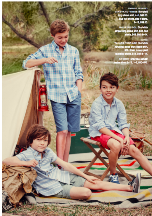
FRANKLIN, FROM LEFT: VINEYARD WINES Blue plaid long-sleeve shirt, 8-14, $49.00. Blue ball shorts, also in stone, 8-14, $39.00. ROSE PISTOL Blue/white striped long-sleeve shirt, $36.00. Red shorts, $45, $20 8-14. HEATED: TAILOR VINTAGE Blue/white horizontal-stripe short-sleeve shirt, $36.00. Brown to navy plaid reversible shorts, $44, $20 8-14. SPERRY Gray/white canvas leather shoe, 8-13, 1-6, $40-$45.