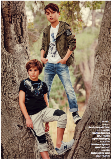
DIESEL TOP LEFT: Black lightning print T-shirt, 4-7, $100, $100. Gray/black fleece multi- part, 4-16, $80. Ivy green hooded parka, 8-16, $150. White Peace Sign short- sleeve T-shirt, 4-7, 8-16, $30. Splatter-print blue-pink jeans, 4-16, $130.