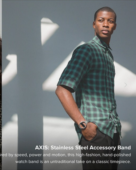
AXIS: Stainless Steel Accessory Band

Inspired by speed, power and motion, this high-fashion, hand-polished watch band is an untraditional take on a classic timepiece.