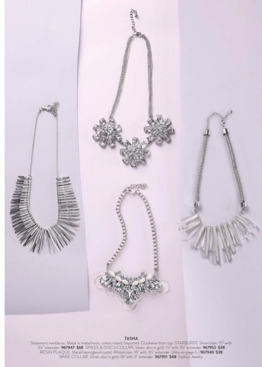
TASHA Statement necklaces. Metal or metal/leather, unless noted. Imported. Checksize from top: STARBURST Silver/leather 17" with 31" extender 967947 548 SPIKES & DISCS COLLAR Silver; also in gold 17" with 31" extender 967952 538 BORN PLACE: Marabou/leather/gold. Silver/leather 18" with 31" extender. Also on page 1: 967949 538 SPIKE COLLAR Silver; also in gold 18" with 31" extender 967951 548 Fashion Jewelry