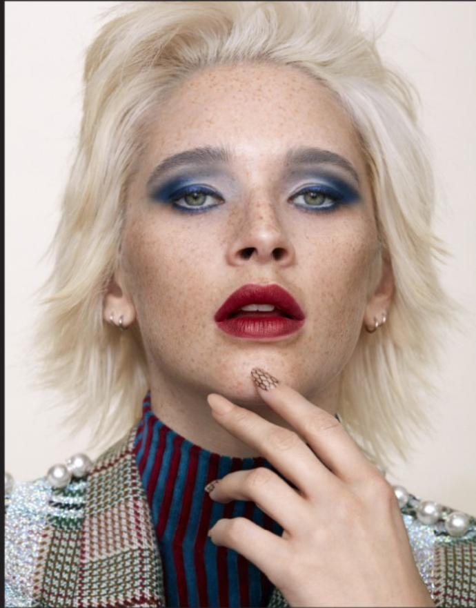
FACE: Radiant Creamy Concealer, NARS; Le Beige in Medium, CHANEL. EYES: Velvet Eyeliner in Les Petites, Velvet Eyeliner in Blue Lotus, Dual Intensity Eye Shadow in Cremikla and Velvet Shadow Stick in Galice, NARS; Le Volume de CHANEL Mascara in Noir, CHANEL. LIPS: Rouge Allure Ink in Choquet, CHANEL.

Striped velvet turtleneck and plaid jacket with pearls, SNOW XTE 640.