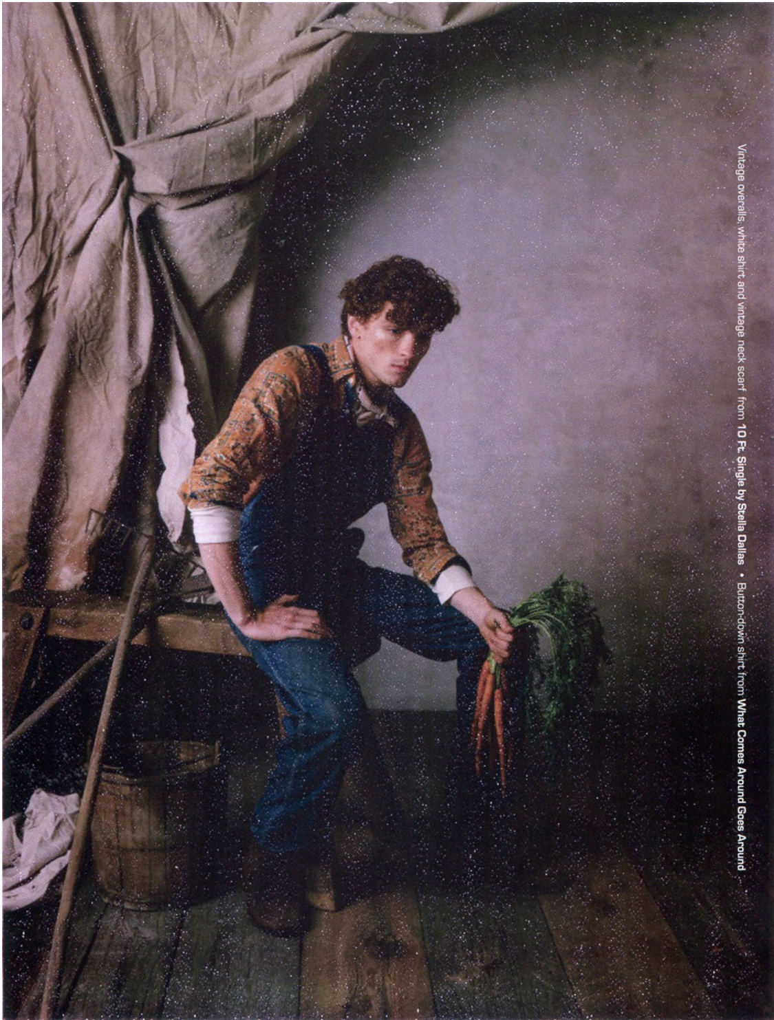
Vintage overalls, white shirt and vintage neck scarf from 10 Ft. Single by Stella Dallas • Burton-down shirt from What Comes Around Goes Around