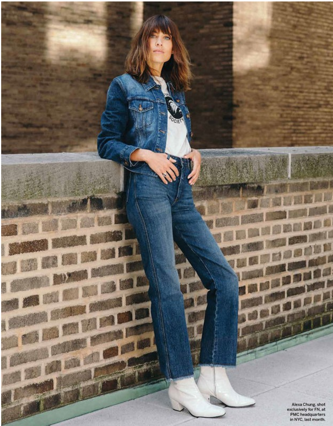
Alexa Chung, shot exclusively for FN, at PMC headquarters in NYC, last month.