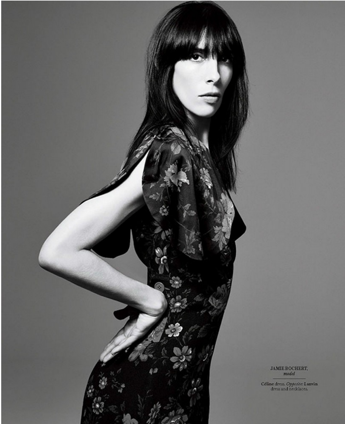
JAMIE BOCHERT, model

Celine dress. Opposite: Lanvin dress and necklaces.