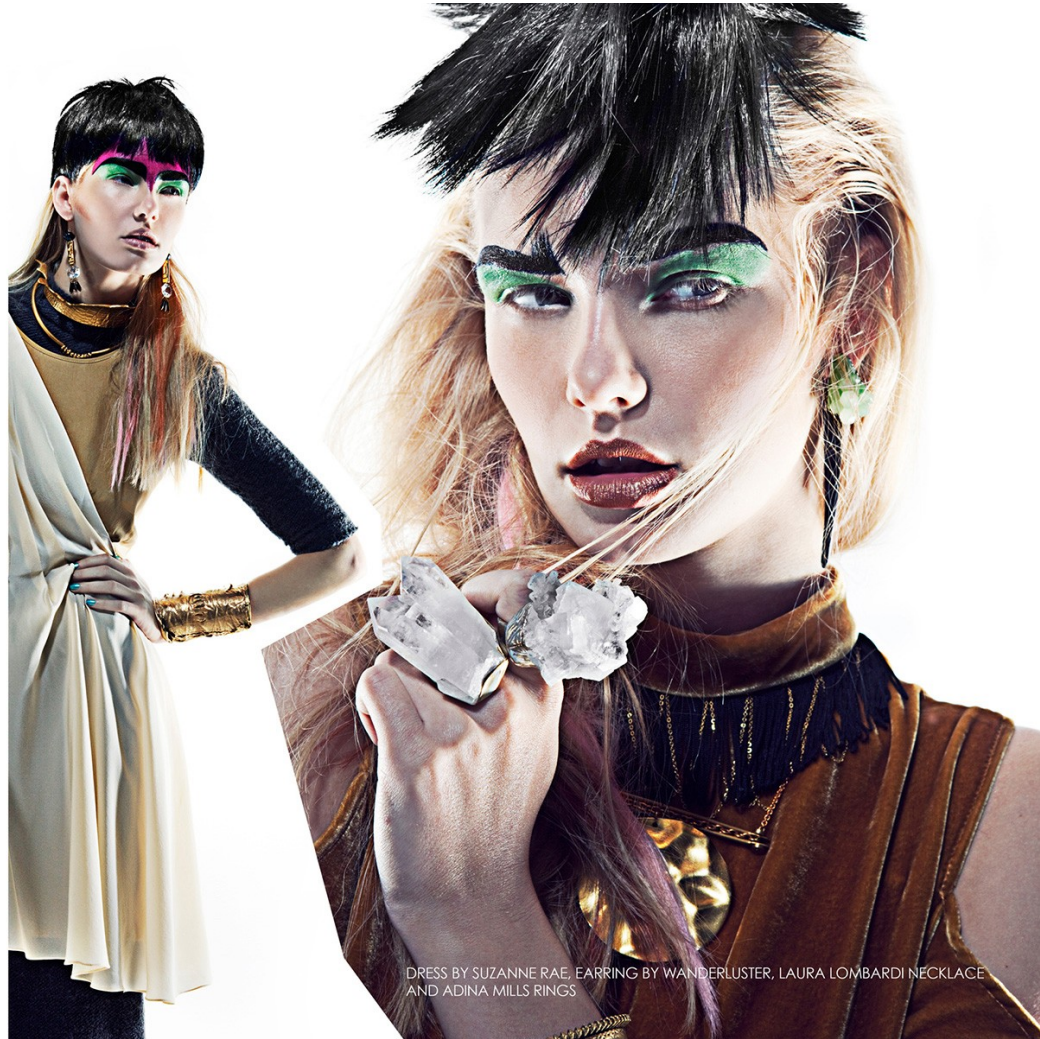
DRESS BY SUZANNE RAE, EARRING BY WANDERLUST, LAURA LOMBARDI NECKLACE AND ADINA MILLS RINGS