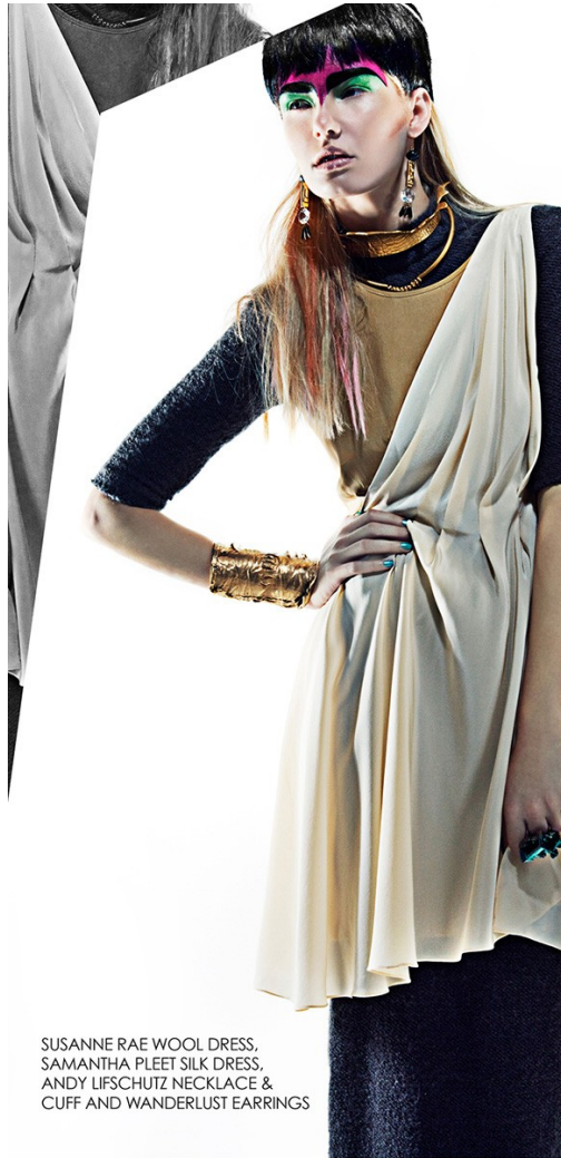
SUSANNE RAE WOOL DRESS, SAMANTHA PLEET SILK DRESS, ANDY LIFSCHUTZ NECKLACE & CUFF AND WANDERLUST EARRINGS