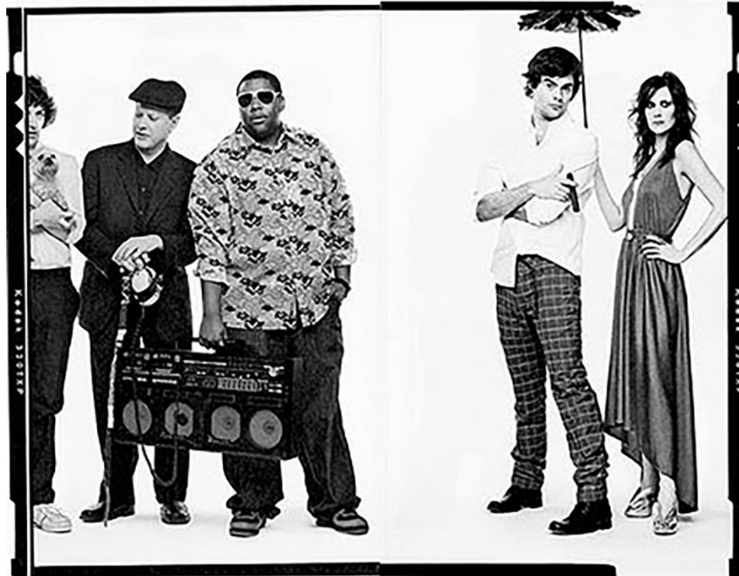
Samuel L. Jackson Samuel L. Jackson