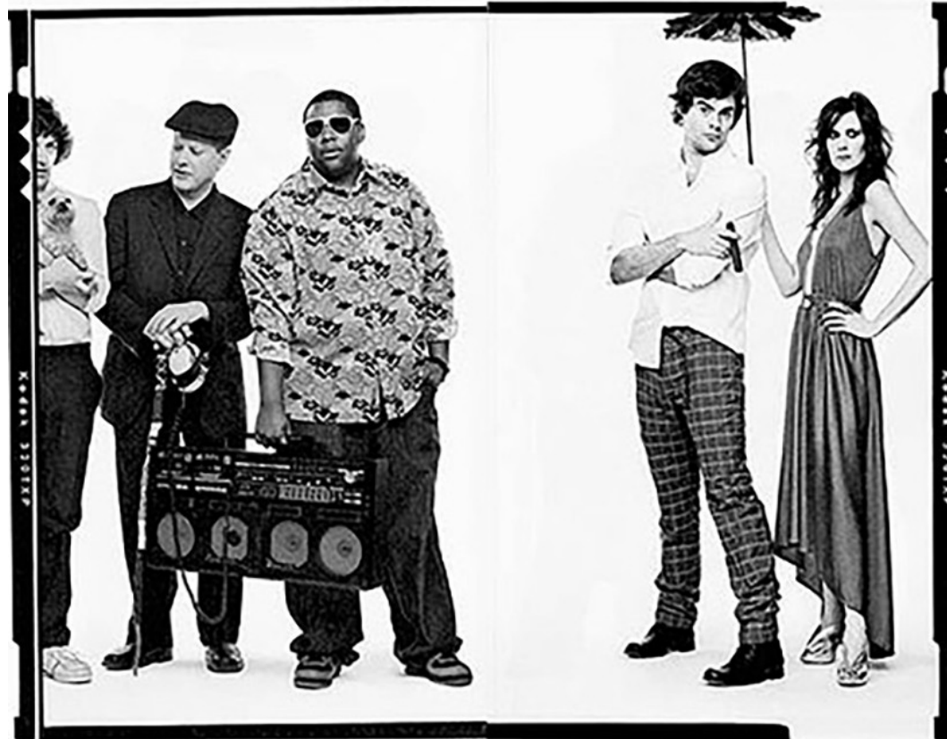
Samuel L. Jackson David Hasselhoff