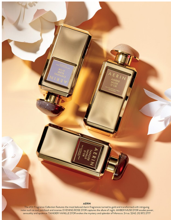
AERIN The AERIN Fragrance Collection features the most beloved Aerin fragrances turned to gold and transformed with intriguing notes such as oud, patchouli and incense. EVENING ROSE D'OR captures the allure of night. AMBER MUSK D'OR exudes power, sensuality and opulence. TANGIER VANILLE D'OR evokes the mystery and splendor of Morocco. 3.4 oz. $240. 212 872 2777