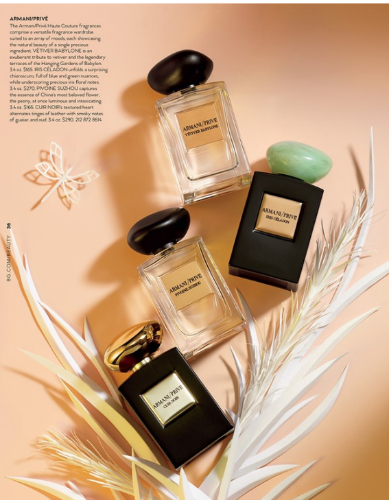
ARMANI PRIVE The ArmaniPrive Haute Couture fragrances comprise a versatile fragrance wardrobe suited to an array of moods, each showcasing the natural beauty of a single precious ingredient. VETIVER BABYLONE is an evocative tribute to vetiver and the legendary terraces of the Hanging Gardens of Babylon. 3.4 oz. $66. PINK CLAUDE unfolds a surprising character, full of blue and green nuances, with underlying precious iris floral notes. 3.4 oz. $270. PIVOINE SUSHOU captures the essence of China's most beloved flower—the peony, at once luminous and intoxicating. 3.4 oz. $165. OUR NORD's textured heart alternates tingles of leather with smoky notes of guaiac and oud. 3.4 oz. $290. 212 872 8614