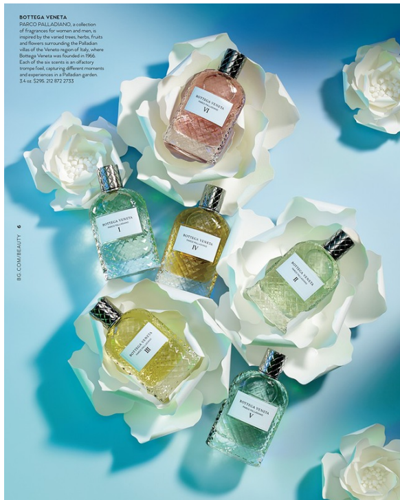
BOTTEGA VENETA PARCO PALLADIANO , a collection of fragrances for women and men, is inspired by the varied trees, herbs, fruits and flowers surrounding the Palladian villa of the Veneto region of Italy where Bottega Veneta was founded in 1966. Each of the six scents is an olfactory tongue fork, capturing different moments and experiences in a Palladian garden. 3.4 oz. $295. 212.872.2713