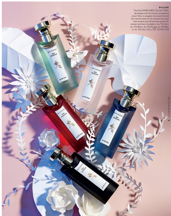
BVLGARI The EAU PARFUMÉE COLLECTION , developed with the house's exceptional savoir-faire, is uniquely structured around the natural notes of rare and precious oils that awaken and refresh the senses. For women and men. Available in Au The Vert, Au The Blanc, Au The Rouge, Au The Bleu, or Au The Noir. 2.5 oz. $97. 212.872.2725