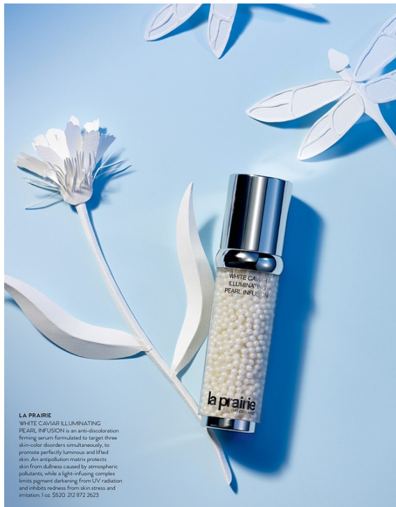
LA PRAIRIE WHITE CAVIAR ILLUMINATING PEARL INFUSION is an anti-discoloration firming serum formulated to target three skin-color disorders simultaneously, to promote perfectly luminous and lifted skin. An anti-pollution matrix protects skin from dullness caused by atmospheric pollutants, while a light-infusing complex limits pigment darkening from UV radiation and inhibits redness from skin stress and irritation. 1 oz. $520. 212.872.2623