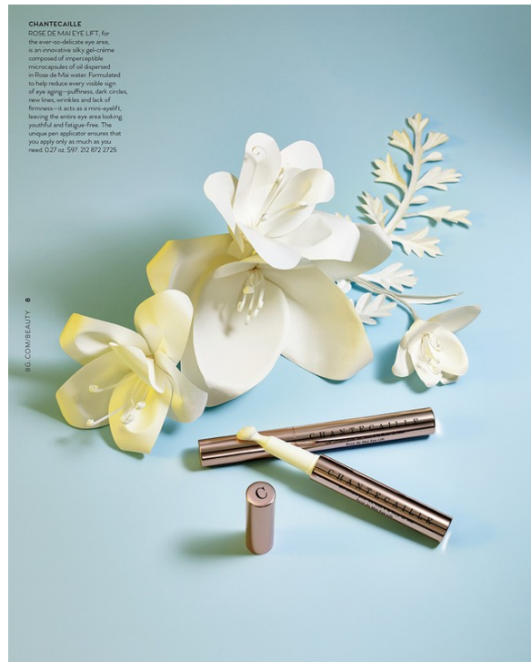
CHANTECAILLE DOSE DE MIEL EYE LIFT , for the ever-so-delicate eye area, is an innovative anti-gelcosome composed of imperceptible microcapsules of oil dispersed in floue de Miel water. Formulated to help reduce every visible sign of eye aging: puffiness, dark circles, new lines, wrinkles and lack of firmness—acts as a mini-spa, leaving the entire eye area looking youthful and fatigue-free. The unique pen applicator ensures that you apply only as much as you need. 0.27 oz. $97. 212.872.2725