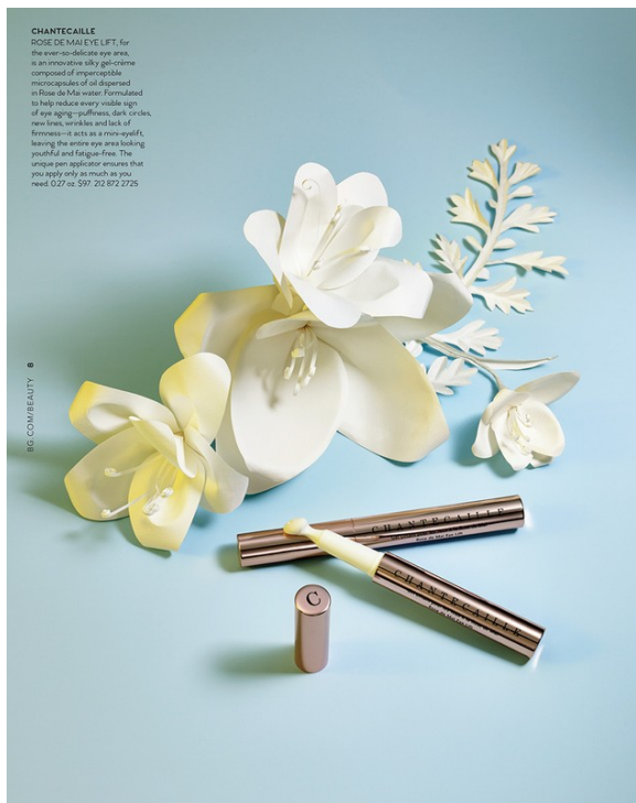
CHANTECAILLE DOSE DE MAI EYE LIFT , for the ever-so-delicate eye area, is an innovative silky gel-cream composed of imperceptible micro-particles of oil dispersed in floue de Mer water. Formulated to help reduce every visible sign of eye aging: puffiness, dark circles, new lines, wrinkles and lack of firmness—acts as a mini-splift, leaving the entire eye area looking youthful and fatigue-free. The unique pen applicator ensures that you apply only as much as you need. 0.27 oz. $97. 212.872.2725.