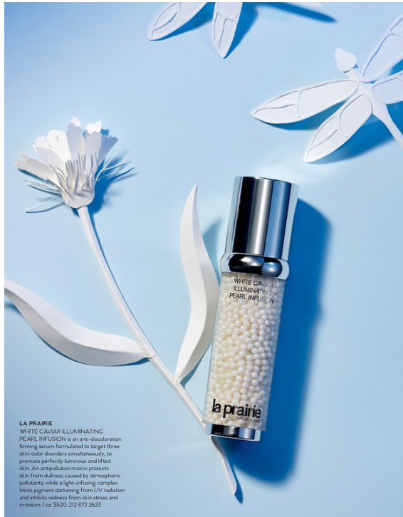
LA PRAIRIE WHITE CAVIAR ILLUMINATING PEARL INFUSION is an anti-discoloration firming serum formulated to target three skin-color disorders simultaneously, to promote perfectly luminous and lifted skin. An anti-pollution matrix protects skin from dullness caused by atmospheric pollutants, while a light-infusing complex limits pigment darkening from UV radiation and inhibits redness from skin stress and irritation. 1 oz. $520. 212.872.2623