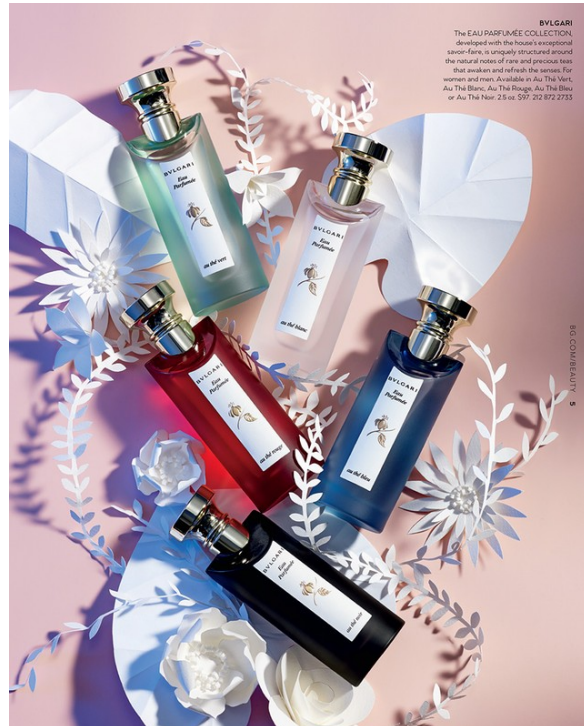
BVLGARI The EAU PARFUMÉE COLLECTION , developed with the house's exceptional savoir-faire, is uniquely structured around the natural notes of rare and precious oils that awaken and refresh the senses. For women and men. Available in Au The Vert, Au The Blanc, Au The Rouge, Au The Bleu, or Au The Noir. 2.5 oz. $97. 212.872.2725