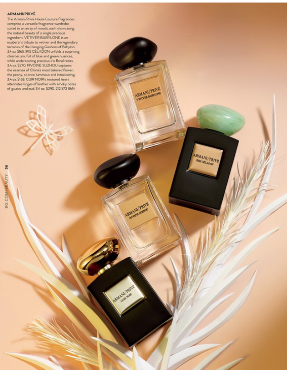
ARMANI PRIVE The Armani Prive Haute Couture fragrances comprise a versatile fragrance wardrobe suited to an array of moods, each showcasing the natural beauty of a single precious ingredient. VETIVER BABYLONE is an evocative tribute to vetiver and the legendary terraces of the Hanging Gardens of Babylon. 3.4 oz. $665. PINK CLAUDE is a surprising character, full of blue and green nuances, with underlying precious iris floral notes. 3.4 oz. $270. PIVOINE SUSHOU captures the essence of China's most beloved flower—the peony, at once luminous and intoxicating. 3.4 oz. $165. OUR NORD's textured heart alternates tingles of leather with smoky notes of guaiac and oud. 3.4 oz. $290. 212 872 8614