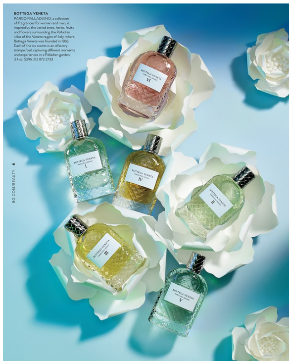
BOTTEGA VENETA PARCO PALLADIANO , a collection of fragrances for women and men, is inspired by the varied trees, herbs, fruits and flowers surrounding the Palladian villa of the Veneto region of Italy where Bottega Veneta was founded in 1966. Each of the six scents is an olfactory tongue fork, capturing different moments and experiences in a Palladian garden. 3.4 oz. $295. 212.872.2713