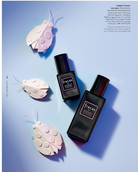
ROBERT PIGUET ONLY FRACAS EAU DE NIQUAM TRAVELER DUO presents the iconic and luscious tuberose fragrance—considered Piguet's magnum opus—in a set that is perfect for any voyager. Includes a 3.4-oz. flacon and 1-oz. convenient travel spray. $185. 212 872 2733 Receive a complimentary 2.5 oz. Fracas Body Lotion with purchase of your Traveler Duo, while supplies last.