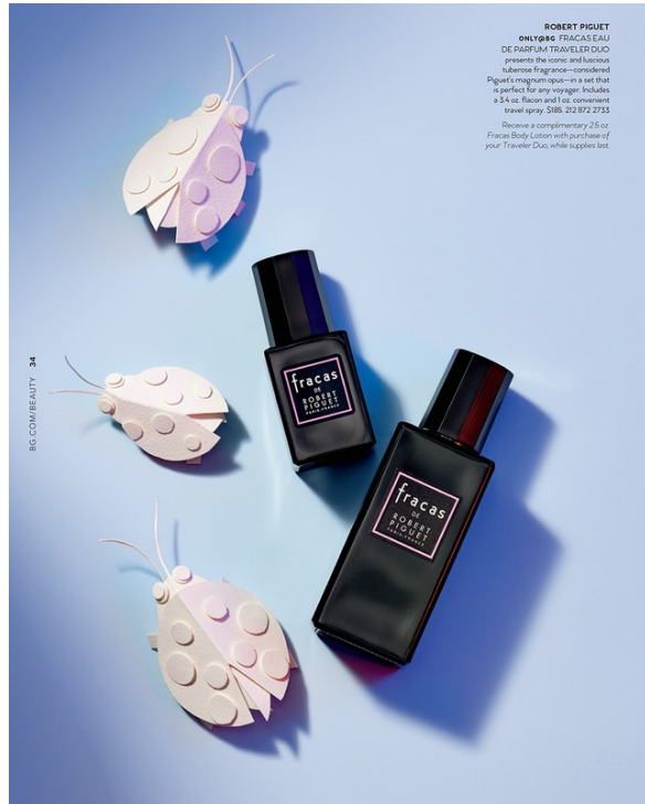
ROBERT PIGUET ONLYFRAS FRACAS EAU DE PROFUMI TRAVELER DUO presents the iconic and luscious tuberose fragrance—considered Piguet's magnum opus—in a set that is perfect for any voyager. Includes a 3.4-oz. flacon and 1-oz. convenient travel spray. $185. 212 872 2733 Receive a complimentary 2.5 oz. Fracas Body Lotion with purchase of your Traveler Duo, while supplies last.