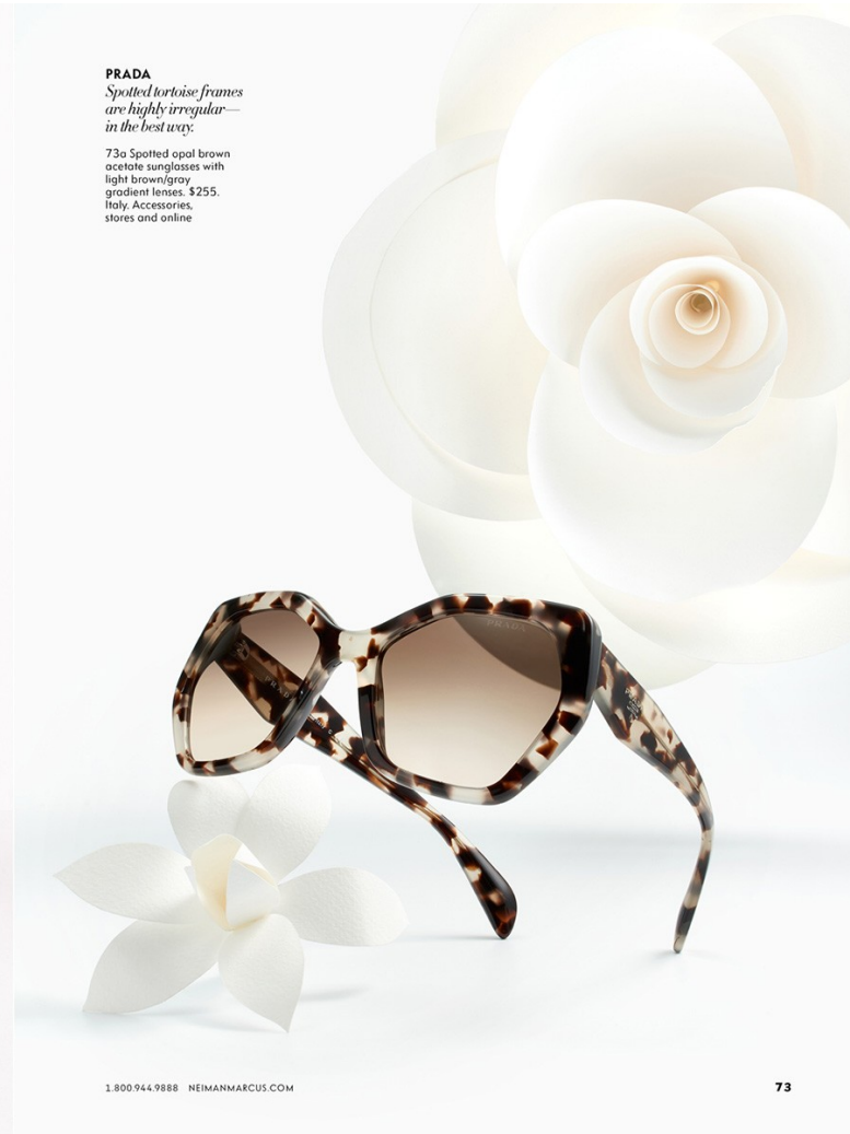
PRADA Spotted tortoise frames are highly irregular—in the best way.

FREE SHIPPING. EVEN FASTER FOR INCIRCLE.™