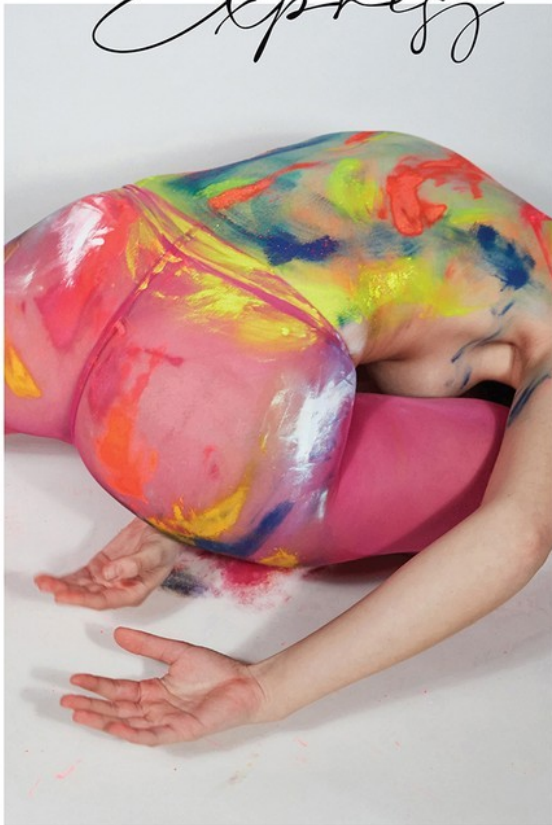
Styling by JOANNE BLADES