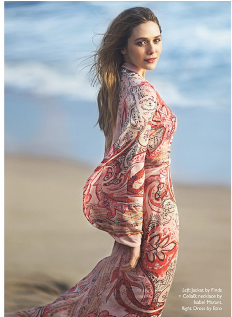
Left: Jacket by Fendi + CellaB; necklace by Isabel Marant. Right: Dress by Etro