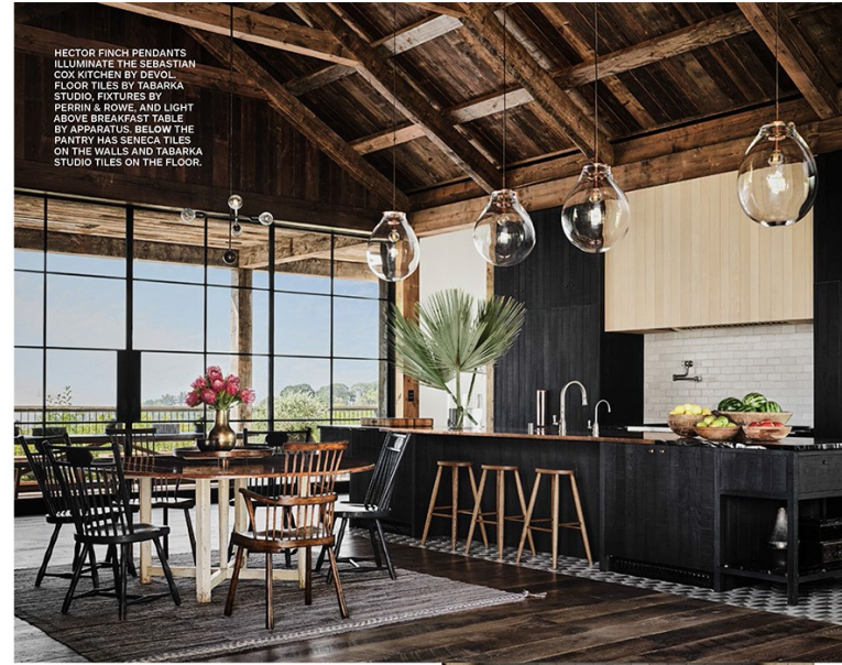
HECTOR FINCH PENDANTS ILLUMINATE THE SEBASTIAN COX KITCHEN BY DEVOL. FLOOR TILES BY TABARKA STUDIO. FIXTURES BY PERRIN & ROWE. AND LIGHT ABOVE BREAKFAST TABLE BY APPARATUS. BELOW THE PANTRY HAS SENECA TILES ON THE WALLS AND TABARKA STUDIO TILES ON THE FLOOR.

elaborately plotted to capture the beguiling views from, between, and through the various structures. “We wanted the house to look like an old barn, something that had been here for decades, that was then converted into a house. But it also had to feel modern and relevant,” Kutcher elaborates. The design-obsessed duo launched their five-year adventure by assembling independent Pinterest boards to flesh out their personal visions for the project. “Building a house from the ground up is no small thing. This was either going to make us or break us,” Kunis says of the potentially divisive undertaking. Happily, their aesthetic predilections seemed to dovetail neatly. “When we looked at each other's boards, 90 percent of the images we selected were the same, and most of the houses we pinned were designed by Howard,” Kutcher recalls, referring to architect Howard Backen of the AD100 firm Backen & Gilliam Architects. Backen, of course, is a master of the so-called modern farmhouse, renowned for his ability to coax a sense of poetry and a bright, contemporary spirit from distilled vernacular forms and rustic materials. The Kutcher/Kunis residence is a testament to his alchemical handling of reclaimed wood,