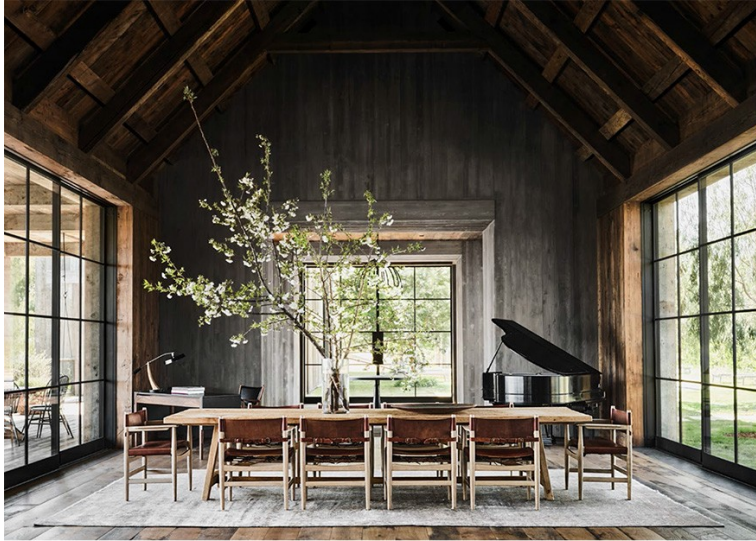
AT ONE END OF THE OPEN LIVING/DINING ROOM, A MATTHEW COX TABLE WITH STAHL + SAND CHAIRS RESTS ON AN ANTIQUE RUG FROM WOVEN. A DE LA ESPADA DESK WITH A VINTAGE LAMP FROM OBSOLETE SITS IN THE CORNER.

powered by photovoltaics, concealed from view above the expansive porch that stretches along one side of the main structure. In fact, the house's solar array produces significantly more power than the property requires, although antiquated municipal codes don't exactly encourage energy sharing—a situation the homeowners hope will change in the future. "Ashton and Mila are concerned about the quality of the soil, the purity of the food they eat and the water they drink. The ideals of sustainability and regenerative farming aren't just abstract concepts to them," Backen avers.