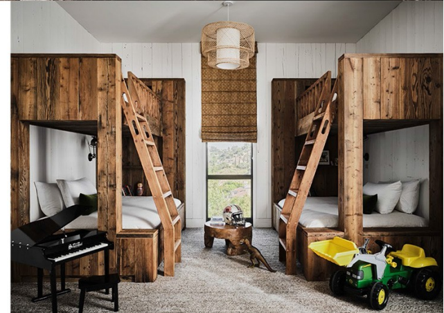
ABOVE LOOKING OUT ACROSS THE VOLUMINOUS ENTERTAINMENT BARR, A GUEST ROOM HAS A CISCO HOME BED AND OTTOMAN AND VAUGHAN LAMPS. RIGHT AN RH TEEN LAMP HANGS IN THE GUEST BUNK ROOM.