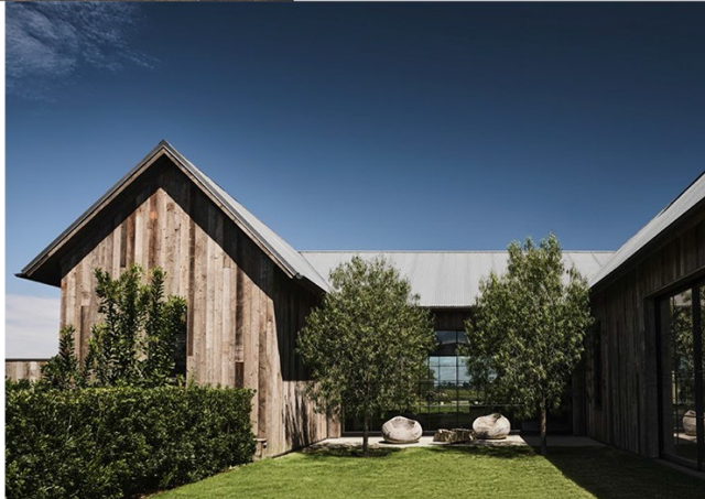
RIGHT AN INTIMATE COURTYARD HAS VIEWS THROUGH THE HOUSE AND OUT TO THE PANORAMIC HILLTOP SITE.