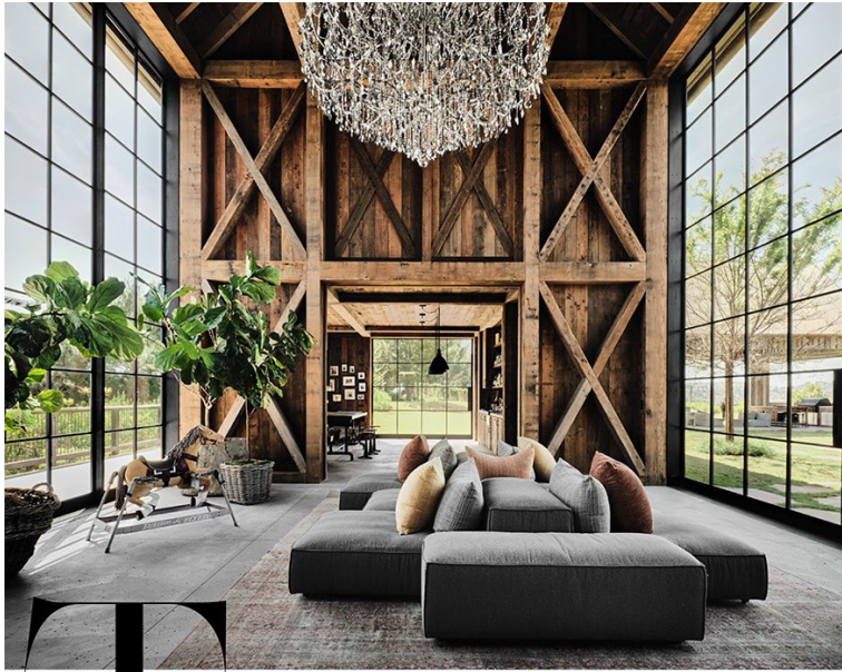
THE CLIENTS' OWN CRYSTAL CHANDELIER CROWNS THE ENTERTAINMENT BARN, WHERE THE GLASS SLIDERS STRETCH 19 FEET TALL. THE CUSTOM SOFA IS COVERED IN PINDLER OUTDOOR FABRIC.