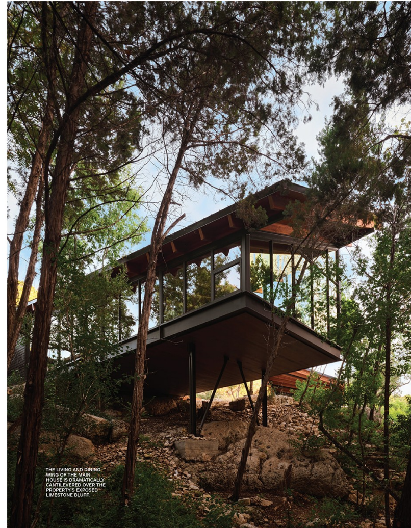
THE LIVING AND DINING WING OF THE MAIN HOUSE IS DRAMATICALLY CANTILEVERED OVER THE PROPERTY’S EXPOSED LIMESTONE BLUFF.

Once the site was chosen, Bercy and Chen developed a plan to break the 3,000-square-foot house into three main volumes. First there’d be a bedroom wing that would run roughly parallel to the creek, then a living-dining-kitchen wing that would jut out over it. The guesthouse, poolhouse, and office would occupy a separate building farther along the site. The buildings’ terrazzo floors and glass walls with dark mullions encourage an outward focus, as do the sculptural roofs, which curve gently at one end and curl dramatically (in the opposite direction) at the other. Supported by glulam beams, each roof swoops down from 16 feet to 4 feet, creating architectural drama while also directing sight lines toward the creek (and blocking views of houses on the other side of the ravine). The architects covered the ceilings in Douglas fir boards, which they lit gently from below. Says Bercy, “We use wood to offset the coldness of the glass and steel.”