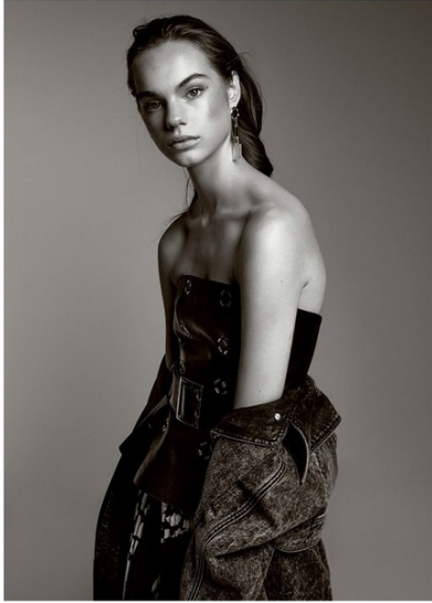
DEWEN COAT VERANOQUE LERON, ELIOTTA BRUTER MICHEL, KARDOLLI DODDI BORGIO DALYI PAULI, DENNE COAT VERANOQUE LERON, LEATHER BRUTER MICHEL, PLEATED SLIP PRINCEA SCHMIDT, LARSENOL DODDI BORGIO, MONTE USARI, WILSON T. DILLI.