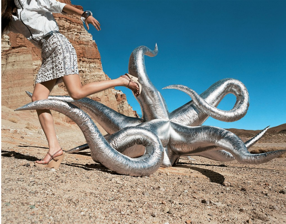
Blossom American Appareil: minigonna di pique brodée e cintura di pelle argentea, D&G. Bracciale Dinosaur Design: sandali platform di legno e PVC, Calvin Klein Collection.