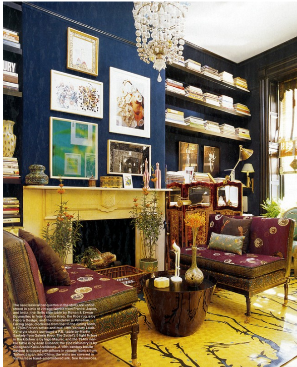
The neoclassical baroque in the study, a collection of art in a mix of styles from France, Japan, and more. The Baroque clock by Robert & Corbucci-Bonnet is from Gustav Klimt, the floor rug is by Ettore Sottsass, and the sculpture is a reproduction of a 17th-century French style and a reproduction of a 19th-century Japanese style. The Zeller's Spot Light in the kitchen is by Ingo Maurer, and the 1950s handbag is by Jean Dreyfus. The clock is by George Kats Architecture. A 19th-century bottle is topped with flowers in general from Italy, Japan, and China, the walls are covered in a mixture of hand-drawn and silk. See Resources.