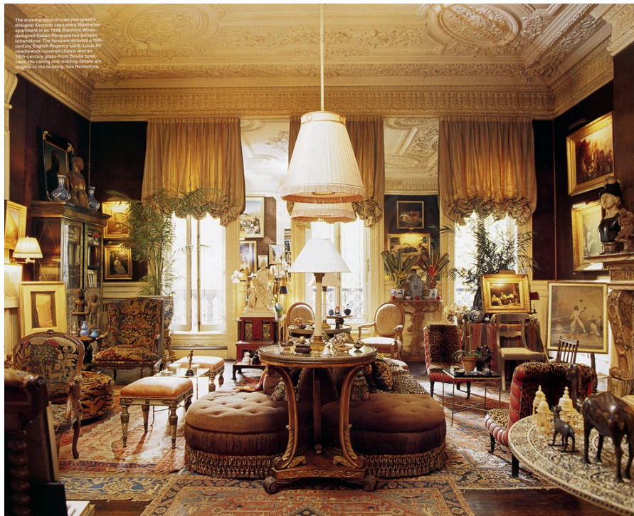
The drawing room of a turn-of-the-century duplex in an 18th-century building in New York City. The room is a mix of styles from France, Japan, and more. The Baroque clock by Robert & Corbucci-Bonnet is from Gustav Klimt, the floor rug is by Ettore Sottsass, and the sculpture is a reproduction of a 17th-century French style and a reproduction of a 19th-century Japanese style. The Zeller's Spot Light in the kitchen is by Ingo Maurer, and the 1950s handbag is by Jean Dreyfus. The clock is by George Kats Architecture. A 19th-century bottle is topped with flowers in general from Italy, Japan, and China, the walls are covered in a mixture of hand-drawn and silk. See Resources.