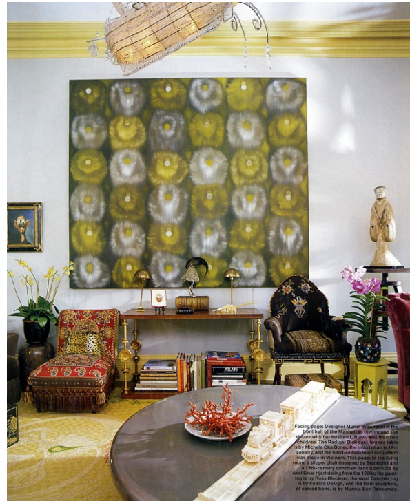
The living room Designer Mauer is a mix of styles from France, Japan, and more. The Baroque clock by Robert & Corbucci-Bonnet is from Gustav Klimt, the floor rug is by Ettore Sottsass, and the sculpture is a reproduction of a 17th-century French style and a reproduction of a 19th-century Japanese style. The Zeller's Spot Light in the kitchen is by Ingo Maurer, and the 1950s handbag is by Jean Dreyfus. The clock is by George Kats Architecture. A 19th-century bottle is topped with flowers in general from Italy, Japan, and China, the walls are covered in a mixture of hand-drawn and silk. See Resources.