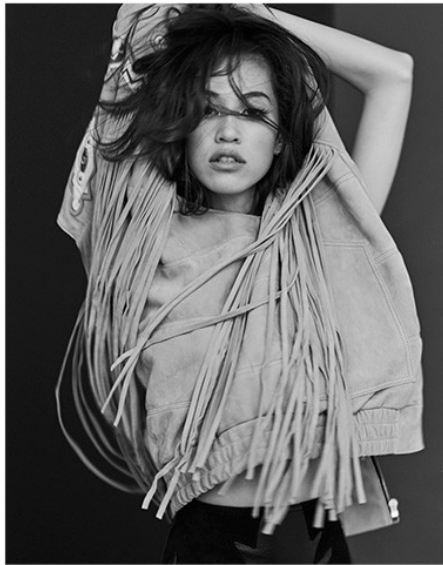
XXXXGivenchy coat, belt and boots. Opposite: Self Portrait coat. Moncler sweater, sandals and trousers.