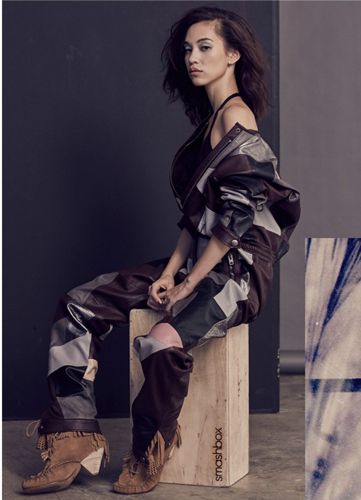
XXXX Givenchy coat, belt and boots. Opposite: Self Portrait coat, Moncler sweater, sandals and trousers.