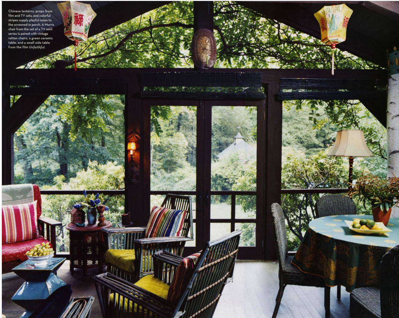
Chinese lanterns, props from film and TV sets and colorful stripes supply playful notes to the screened-in porch. A Morris chair from the set of a TV mini-series is paired with vintage rattan chairs, a green ceramic table, and a small side table from the film Unfaithful .