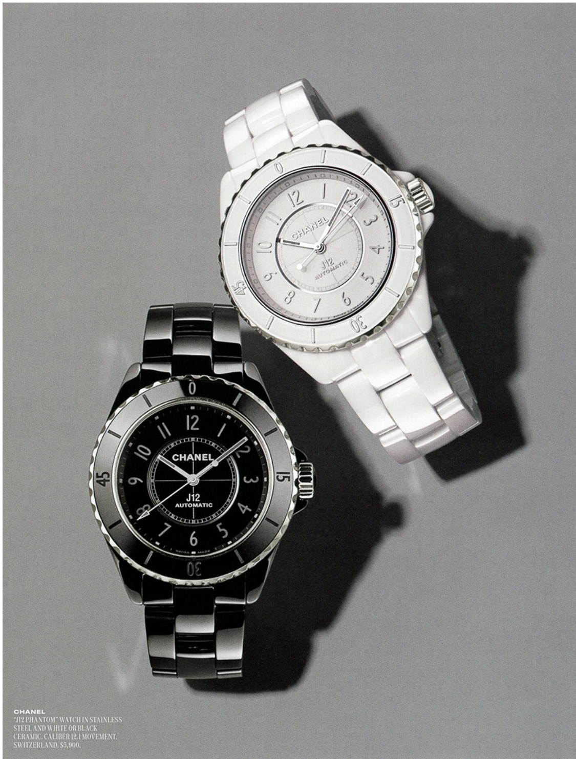
CHANEL "J12 PHANTOM" WATCH IN STAINLESS STEEL AND WHITE OR BLACK CERAMIC, CALIBER J12 MOVEMENT, SWITZERLAND, $5,900.