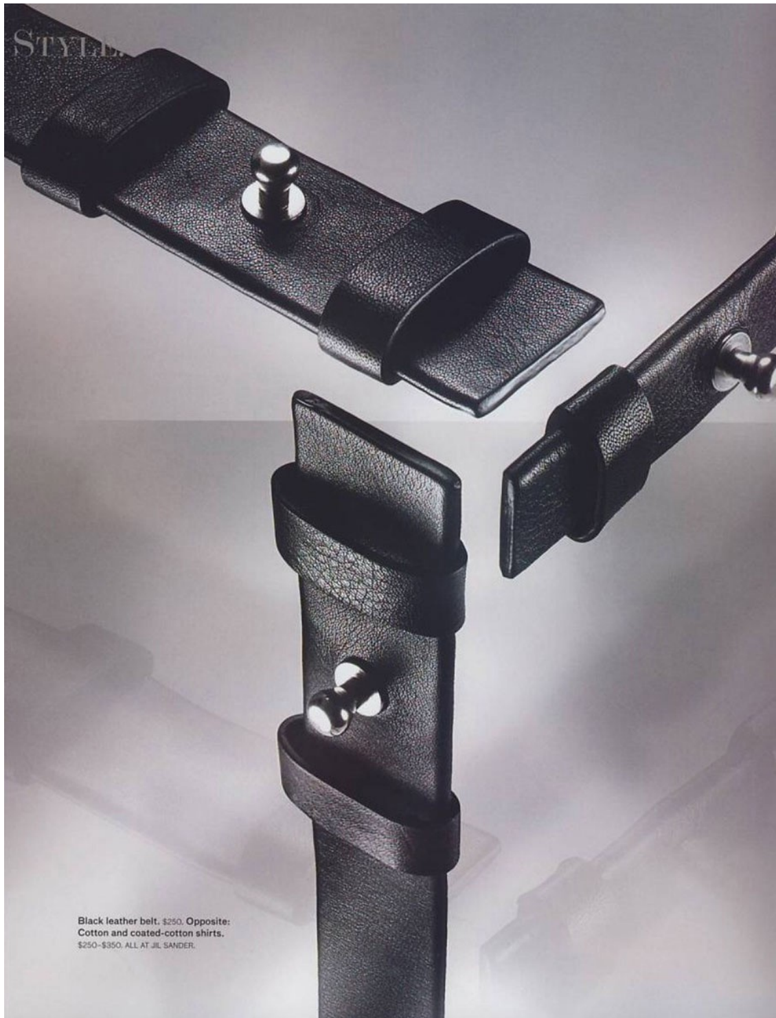
Black leather belt, $250. Opposite: Cotton and coated-cotton shirts, $250-$350. ALL AT JIL SANDER.