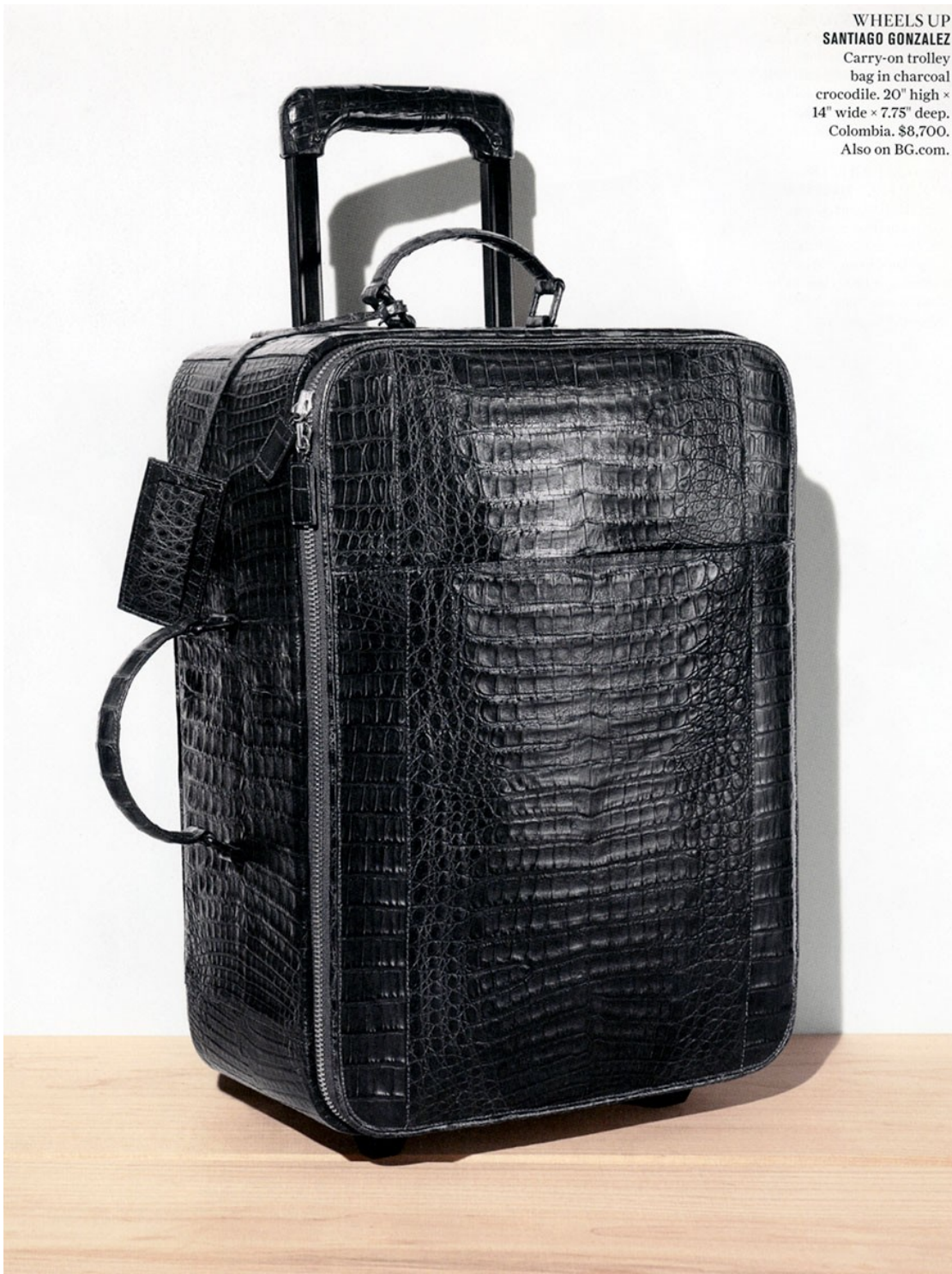
WHEELS UP SANTIAGO GONZALEZ Carry-on trolley bag in charcoal crocodile. 20" high × 14" wide × 7.75" deep. Colombia. $8,700. Also on BG.com.