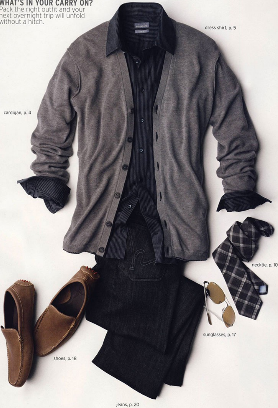
dress shirt, p. 5

WHAT'S IN YOUR CARRY ON? Pack the right outfit and your next overnight trip will unfold without a hitch.