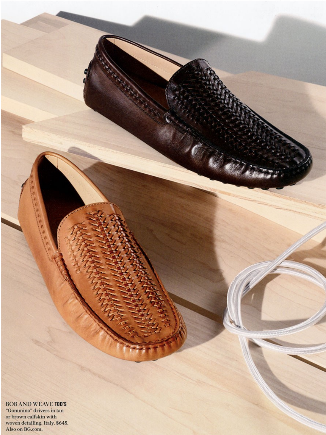
BOB AND WEAVE TOD'S "Gommino" drivers in tan or brown calfskin with woven detailing. Italy. $645. Also on BG.com.