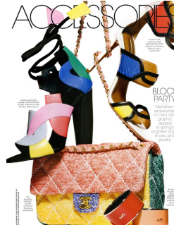
ACCESSORIES BLOCK PARTY A collection of colorful, multi-colored handbags, shoes, and scarves that create a vibrant, multi-colored look.