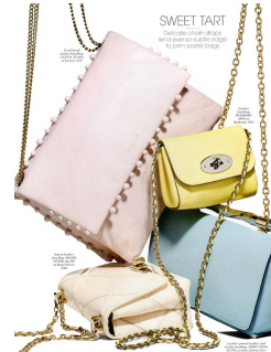
SWEET TART The color of a tart is a classic choice for accessories. The color of a tart is a classic choice for accessories.