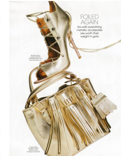
FOILED AGAIN The color of a foiled again is a classic choice for accessories. The color of a foiled again is a classic choice for accessories.