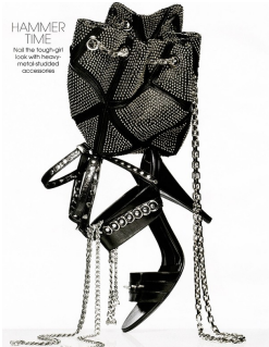
HAMMER TIME Not the "hugger" look with heavy metal, but accessories that are heavy on the eye.