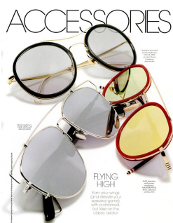
ACCESSORIES FLYING HIGH The color of a flying high is a classic choice for accessories. The color of a flying high is a classic choice for accessories.