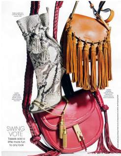
SWING VOICE The color of a swing voice is a classic choice for accessories. The color of a swing voice is a classic choice for accessories.