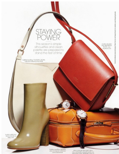
STAYING POWER The color of a staying power is a classic choice for accessories. The color of a staying power is a classic choice for accessories.