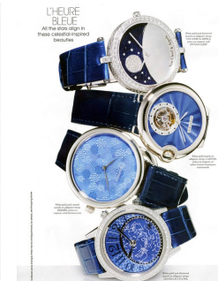
L'HEURE BLEUE The color of an heure bleue is a classic choice for accessories. The color of an heure bleue is a classic choice for accessories.