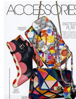
ACCESSORIES PATTERN PLAY The color of a pattern play is a classic choice for accessories. The color of a pattern play is a classic choice for accessories.