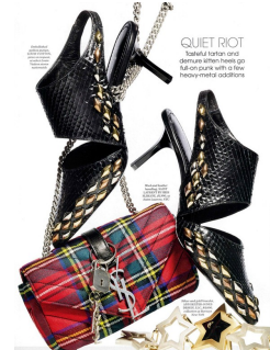
QUIET RIOT Said a quiet and serene, the quiet is a classic choice for accessories. The quiet is a classic choice for accessories.