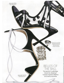
BELLES OF THE BALL The secret to affordable ballroom design is to use the same materials as the expensive ones.