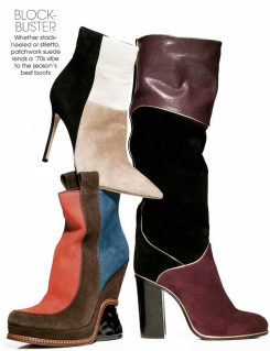
BLOCK-BUSTER Whether black, red, or purple, patchwork is a classic choice for boots. The color to the boot is the boot's best accessory.