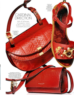
CARDINAL DIRECTION The color of a cardinal is a classic choice for accessories. The color of a cardinal is a classic choice for accessories.