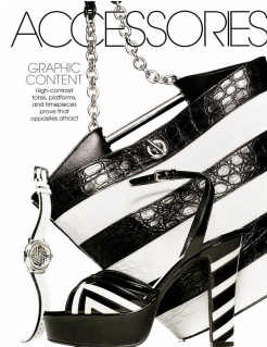
ACCESSORIES GRAPHIC CONTENT High-contrast black patterns and transparent panels that create a graphic effect.