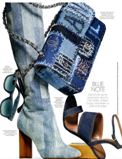
BLUE NOTE The color of a blue note is a classic choice for accessories. The color of a blue note is a classic choice for accessories.