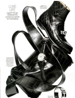
LUXE LIFE The color of a luxe life is a classic choice for accessories. The color of a luxe life is a classic choice for accessories.