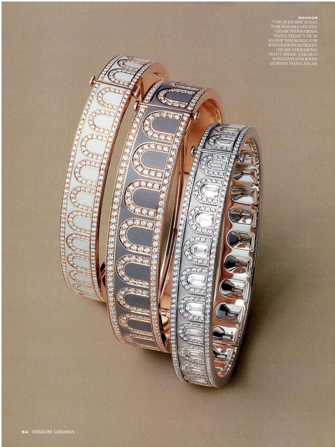
DAVIDOFF "L'ARC DE DAVIDOFF" BANGLE IN 18K ROSE GOLD AND NEIGE CERAMIC WITH DIAMONDS. FRANCE. $33,850. "L'ARC DE DAVIDOFF" WIDE BANGLE IN 18K ROSE GOLD WITH ANTHRACITE CERAMIC AND DIAMONDS. FRANCE. $39,850. "L'ARC DECO" BANGLE IN PLATINUM WITH DIAMONDS. FRANCE. $12,500.