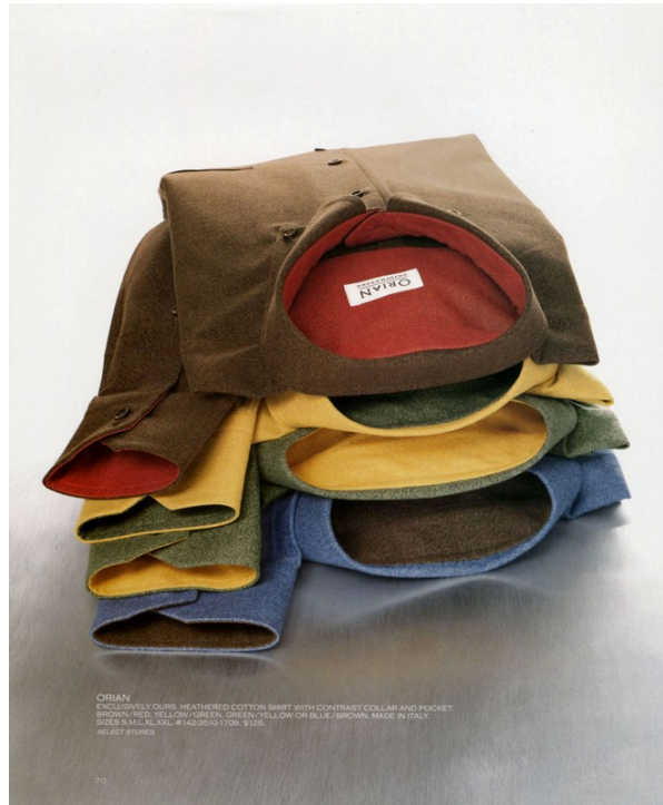
ORIAN EXCLUSIVELY OURS. HEATHERED COTTON SWEAT WITH CONTRAST COLLAR AND POCKET BROWN, RED, YELLOW, GREEN, ORANGE, VILLOW, OR BLUE. BROWN. MADE IN ITALY. SIZES S, M, L, XL. # 142-3010-1708. $125. WE 87 # 1000