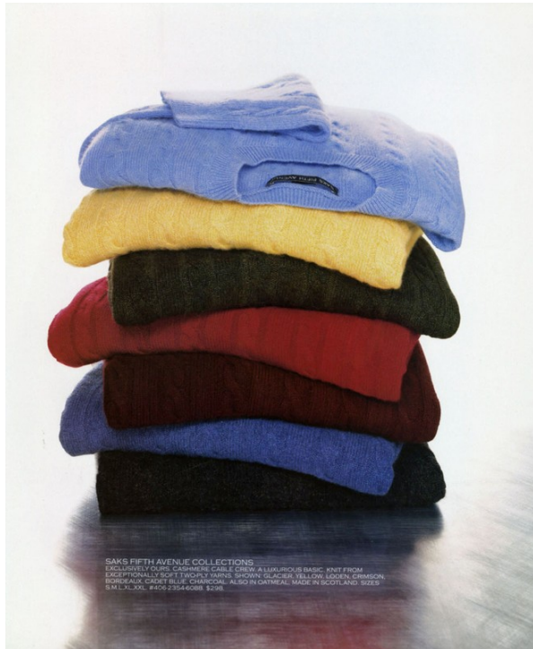
SAKS FIFTH AVENUE COLLECTIONS EXCLUSIVELY OURS. CASHMERE CABLE CREW. A LUXURIOUS BASIC. KNOT FRIM EXCEPTIONALLY SOFT TWEED'S WAYS. CROWN GLASSER. VILLOW LORON. DRAMON. BORDEAUX. CADET BLUE. CHANCOAL. ALSO IN OATMEAL. MADE IN SCOTLAND. SIZES S, M, L, XL. # 142-2344-6088. $298